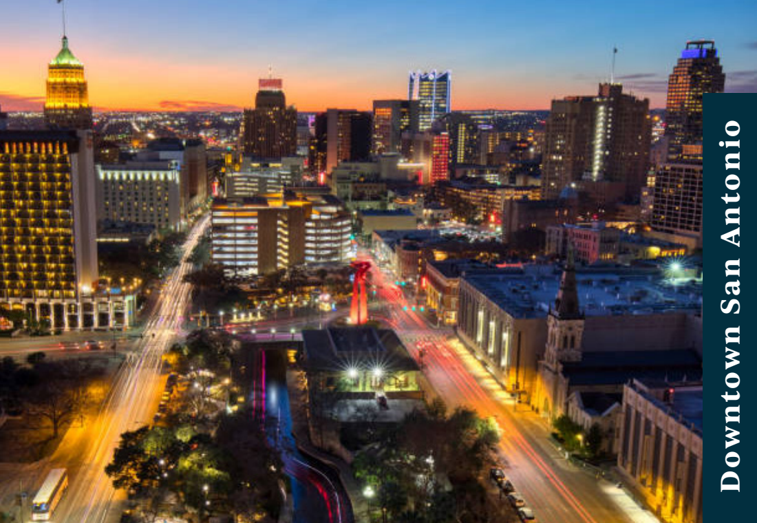
Downtown San Antonio