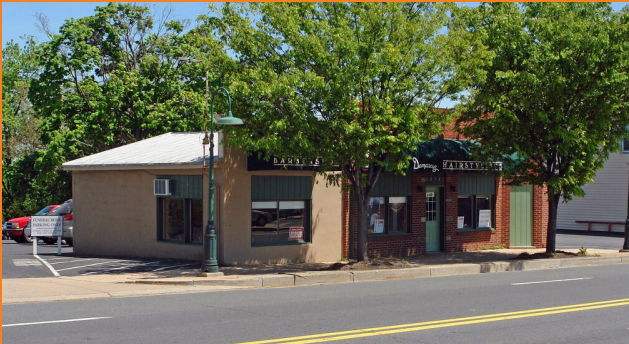
26323 RIDGE RD 1,294 SF

Two adjacent properties offered individually or as a package for $800,000.