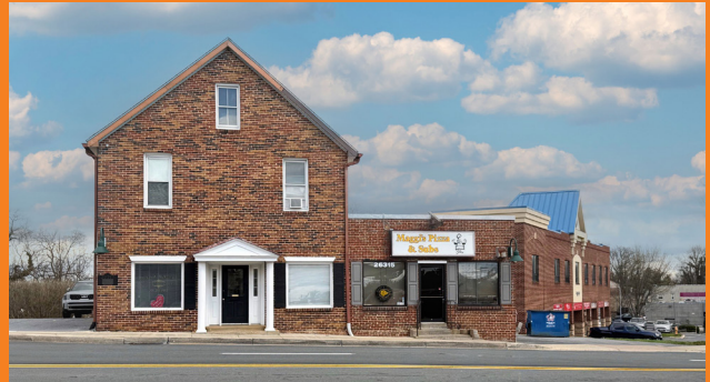
26315-26317 RIDGE RD 3,794 SF

A fully leased, multi-tenant building home to a law firm and Maggi's Pizza & Deli, Additional triangular parcel included for parking.