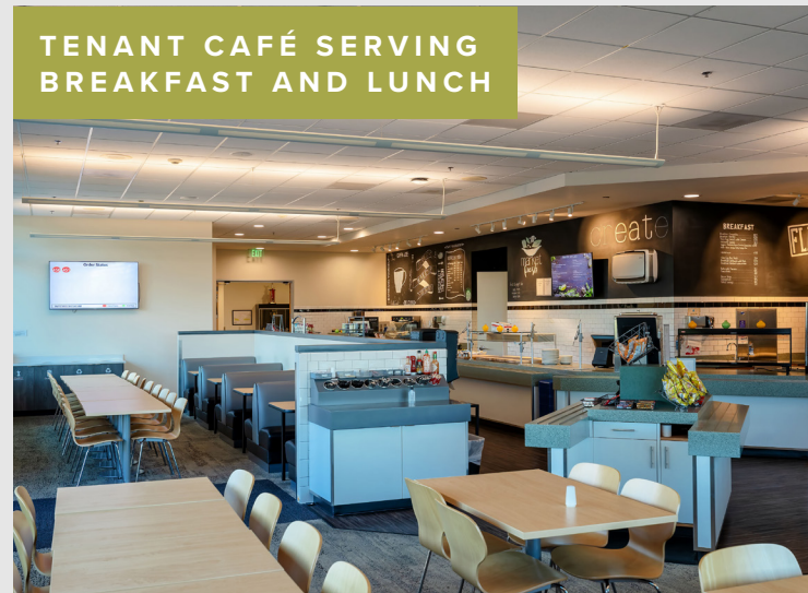
TENANT CAFÉ SERVING BREAKFAST AND LUNCH