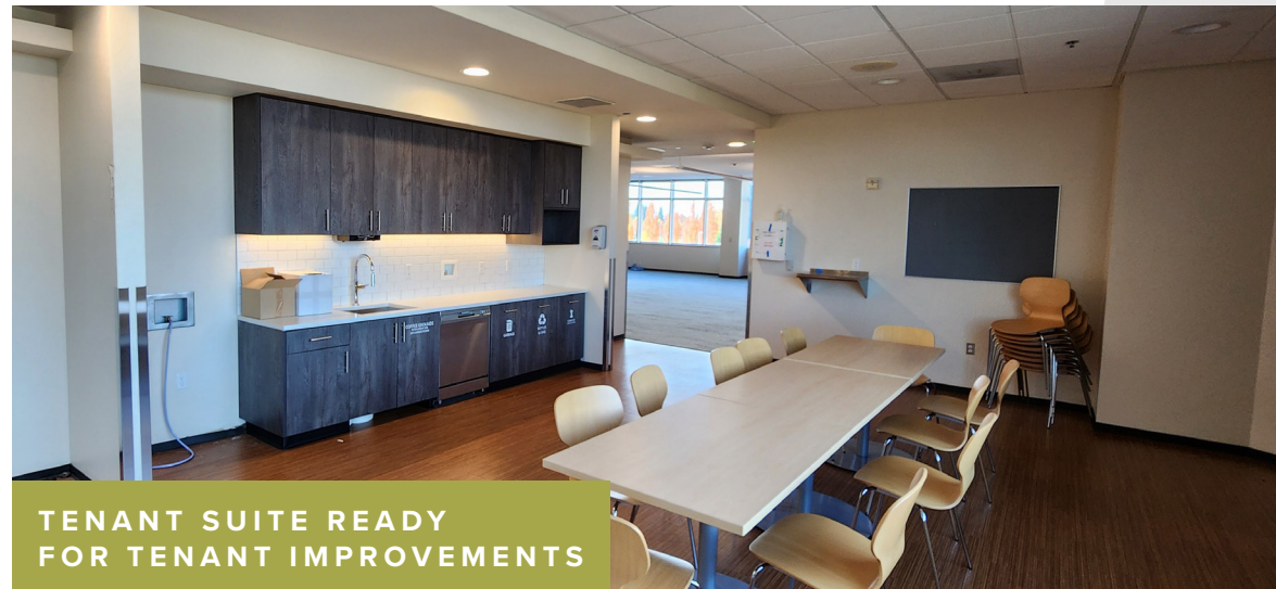
TENANT SUITE READY FOR TENANT IMPROVEMENTS