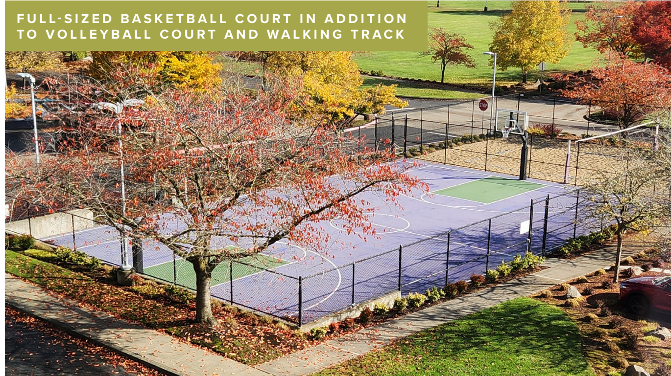
FULL-SIZED BASKETBALL COURT IN ADDITION TO VOLLEYBALL COURT AND WALKING TRACK

Experience the blend of modern Class A design and Oregon's natural beauty at Hillsboro's premier office park. With over 225,000 SF of office space in a park-like setting, make your name in the Sunset Corridor at Elevate.