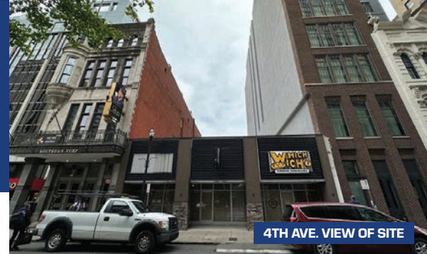
4TH AVE. VIEW OF SITE

With tourism to the city reaching 14.8 million in 2022, this 13% increase from 2021 shows the demand for hospitality in the area, making this site an exceptional opportunity for an investor or developer to transform the space into a thriving hotel venture.