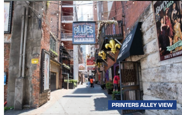
PRINTERS ALLEY VIEW