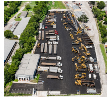
*CONCEPTUAL RENDERING, ACTUAL DESIGN MAY CHANGE