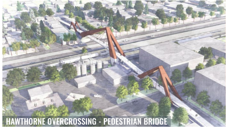
HAWTHORNE OVERCROSSING - PEDESTRIAN BRIDGE