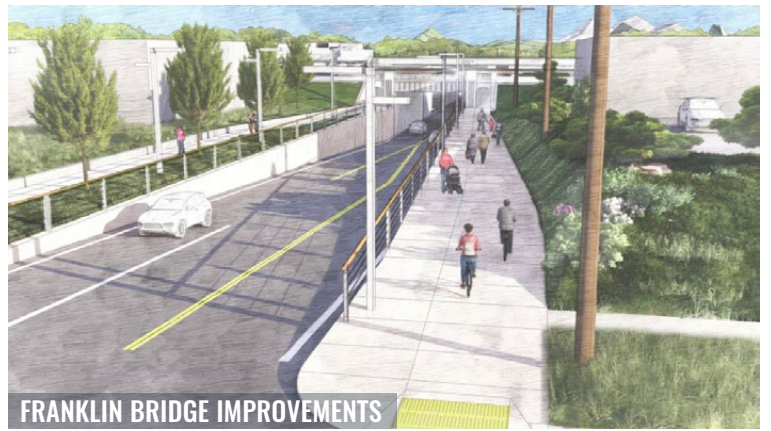
FRANKLIN BRIDGE IMPROVEMENTS