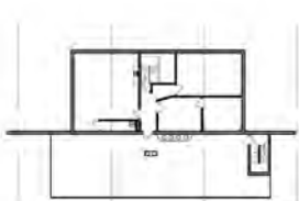
UPPER / MEZZANINE LEVEL PLAN