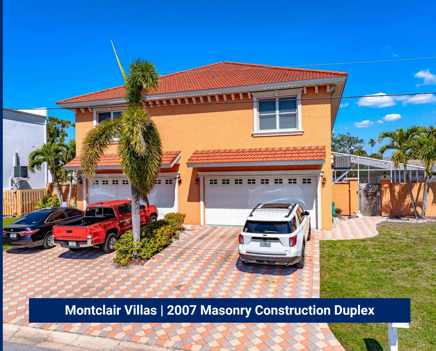
Montclair Villas | 2007 Masonry Construction Duplex