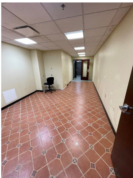
Interior Break Room / Conference Room