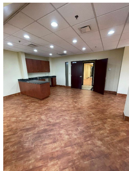
Large Open Office 1