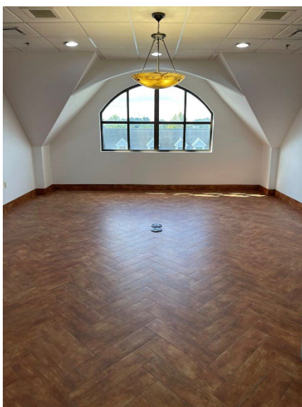
Large Open Office 2