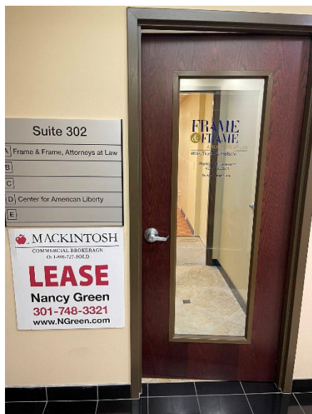
Exit Door from Suite To Common Hallway

The Suite contains an Entrance Room that can be a Conference Room / Break Room, and Three Extra Large Offices.