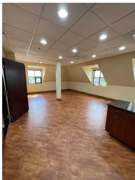
Large Open Office 1 view to South