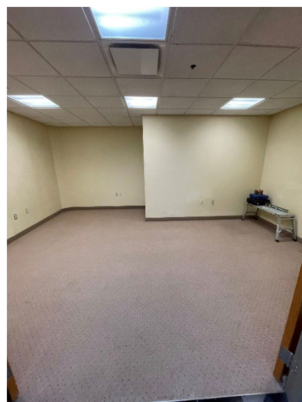
Large Office 3

All information deemed reliable, but not guaranteed