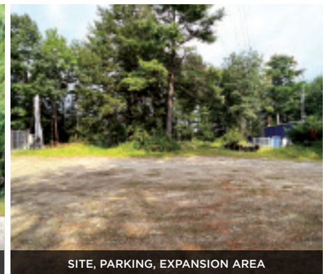
SITE, PARKING, EXPANSION AREA

P.O. Box 7432 Portland ME 04112-7432 • 207.653.6702 • www.roxanecole.com