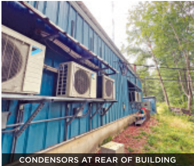
CONDENSERS AT REAR OF BUILDING