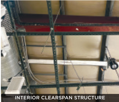
INTERIOR CLEARSPAN STRUCTURE