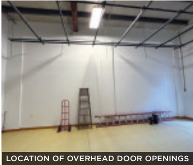
LOCATION OF OVERHEAD DOOR OPENINGS