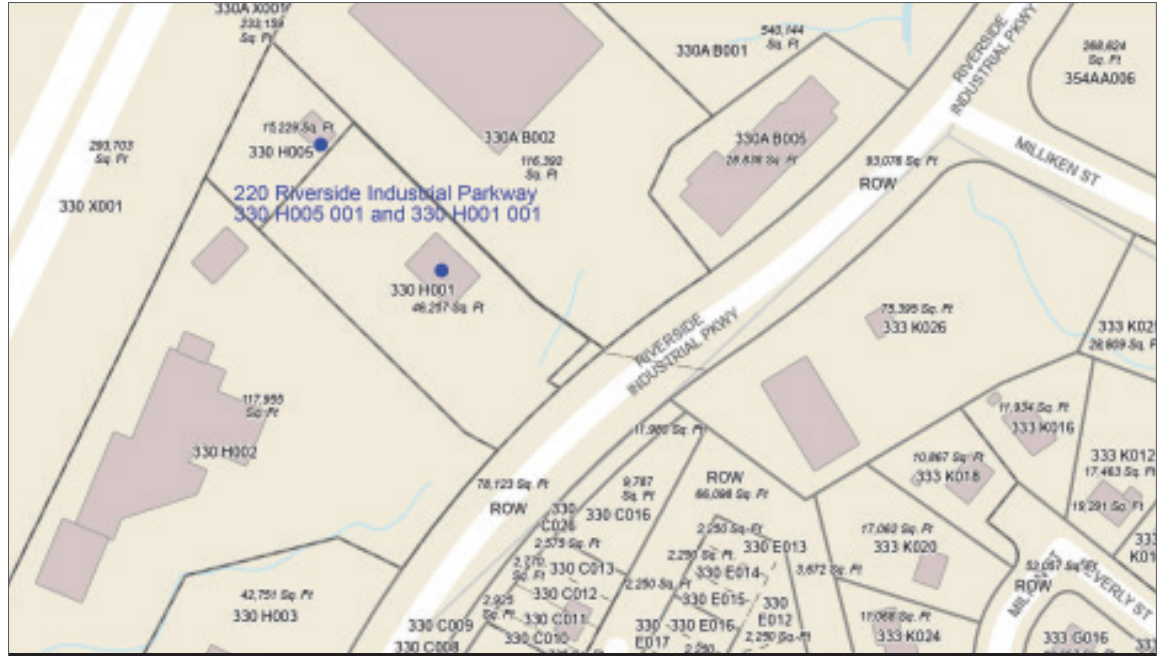
CITY OF PORTLAND TAX ASSESSORS MAP