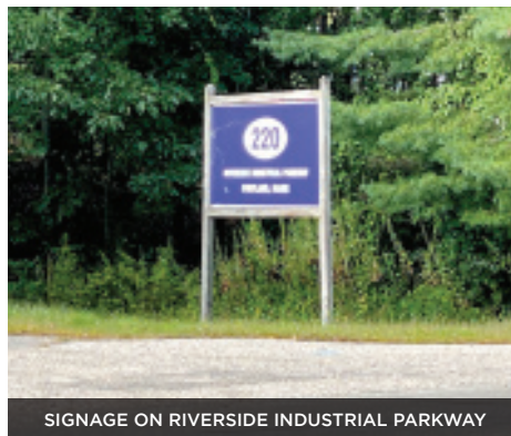
SIGNAGE ON RIVERSIDE INDUSTRIAL PARKWAY