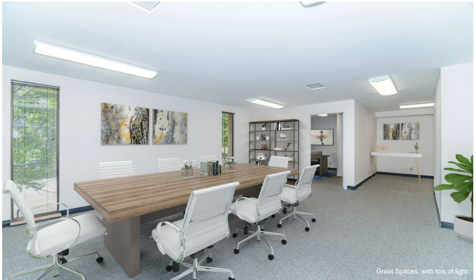
Great Spaces, with lots of light.