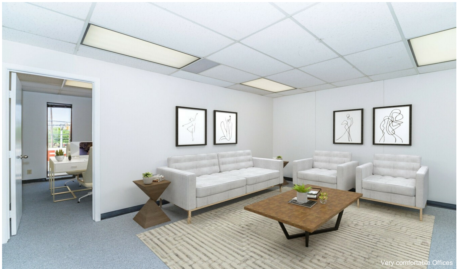
Very comfortable Offices