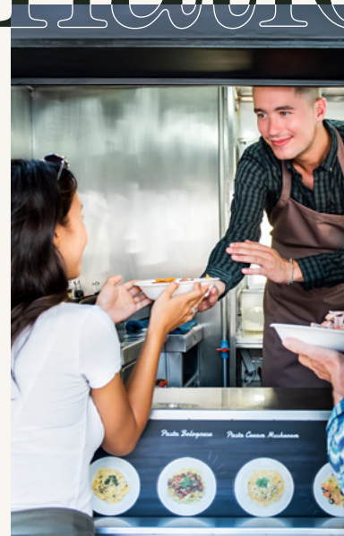
▲ On-Site Food and Refreshment Options