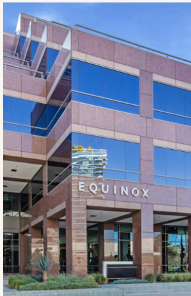
▲ In-House Equinox Fitness