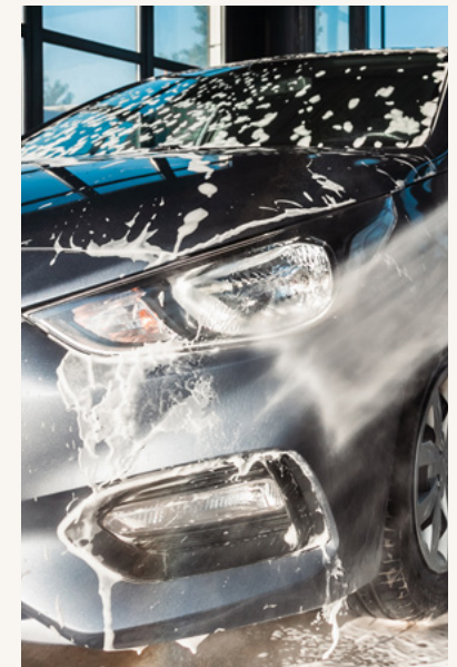
▲ Daily Car Wash Service