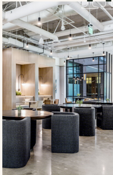
▲ Boutique-Inspired Entertainment Lounge