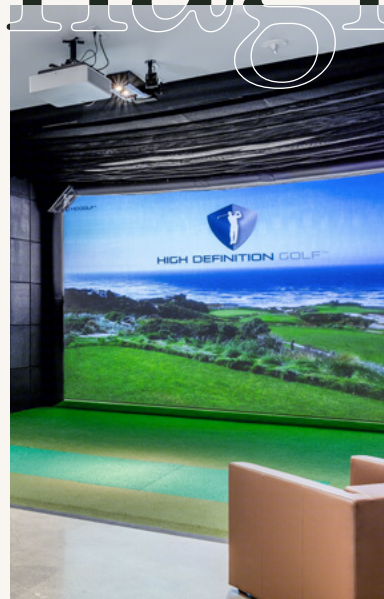
▲ State-of-the-Art Golf Simulator