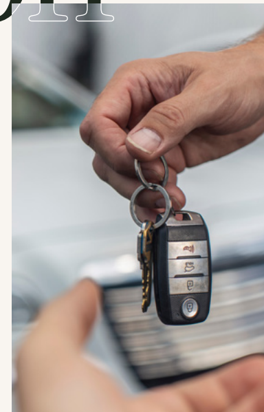
▲ Valet Parking Option