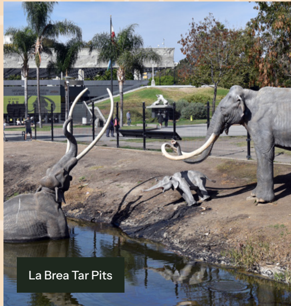
La Brea Tar Pits