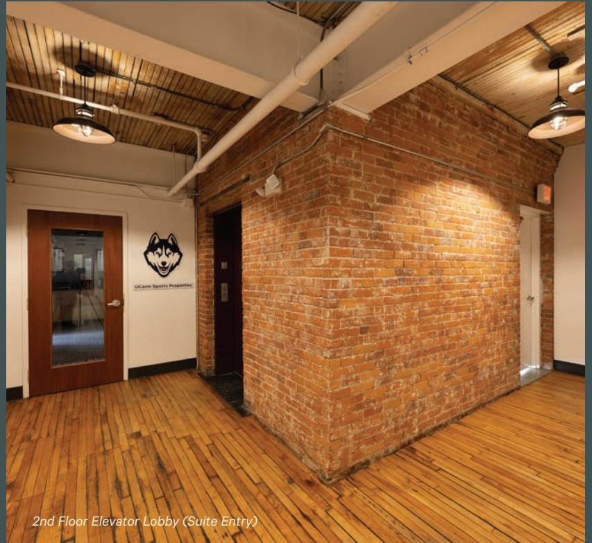
2nd Floor Elevator Lobby (Suite Entry)