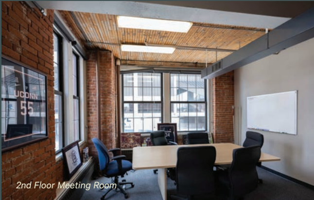
2nd Floor Meeting Room