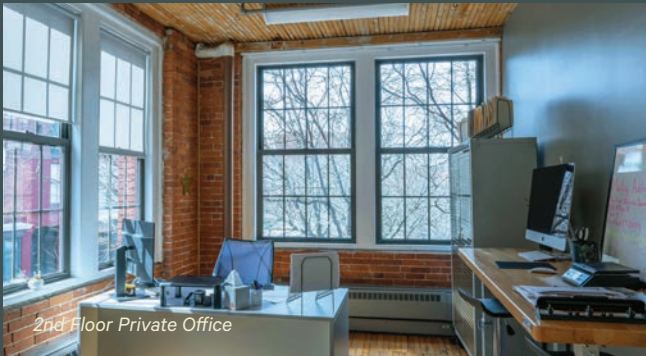
2nd Floor Private Office