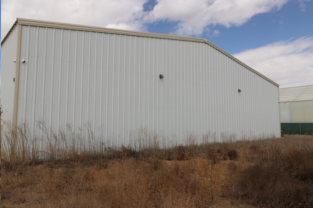
8682 Maverick Lane, Ordway, CO 81063—LG Investment Group, LLC