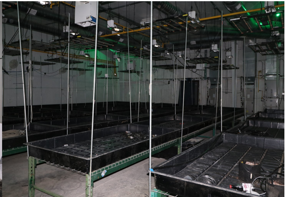
8682 Maverick Lane, Ordway, CO 81063—LG Investment Group, LLC