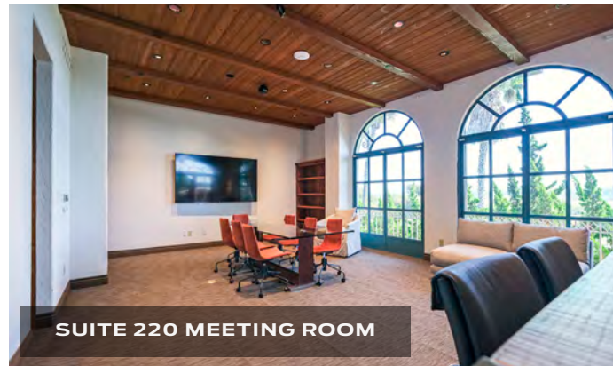
SUITE 220 MEETING ROOM