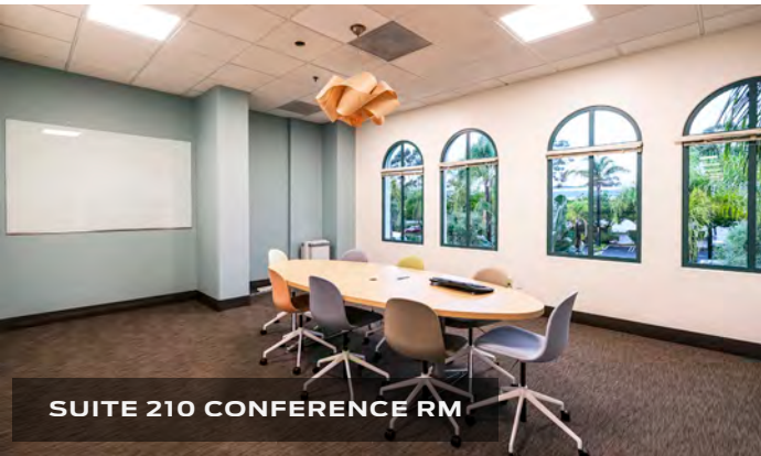
SUITE 210 CONFERENCE RM

Class A Creative/Office Space Positioned in the South Coast's Robust Engineering & Tech Corridor