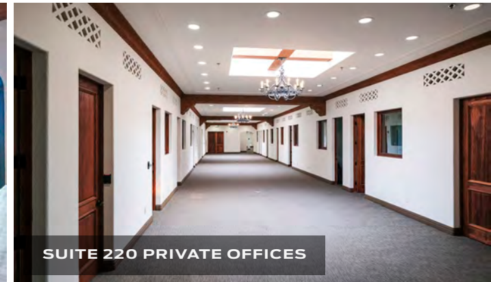
SUITE 220 PRIVATE OFFICES