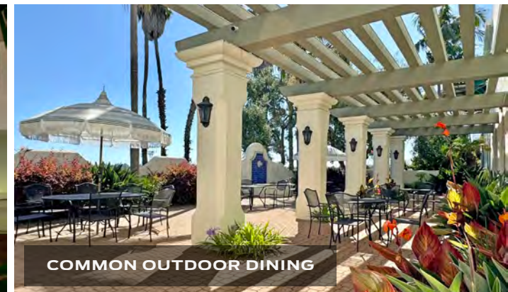
COMMON OUTDOOR DINING