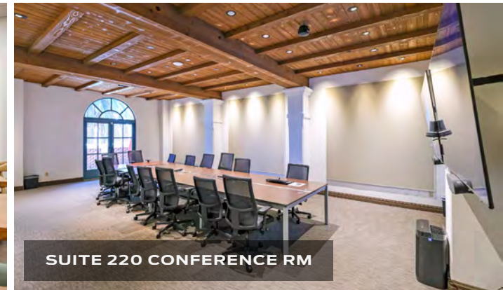
SUITE 220 CONFERENCE RM