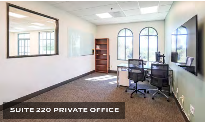
SUITE 220 PRIVATE OFFICE