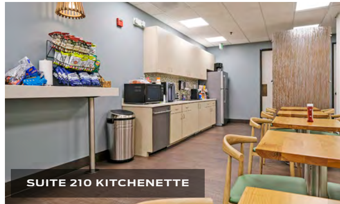
SUITE 210 KITCHENETTE