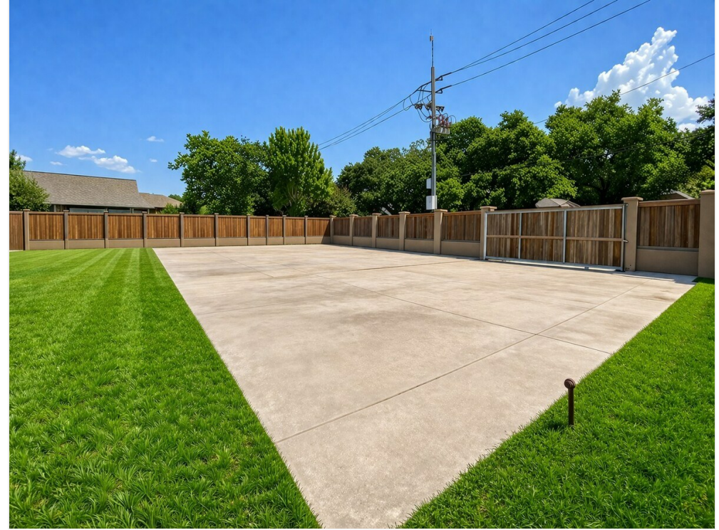
Sunny backyard with landscaped concrete slab