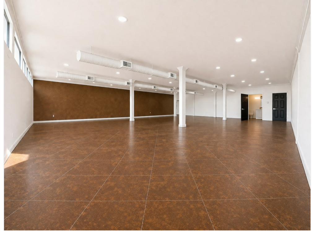
Interior image 3