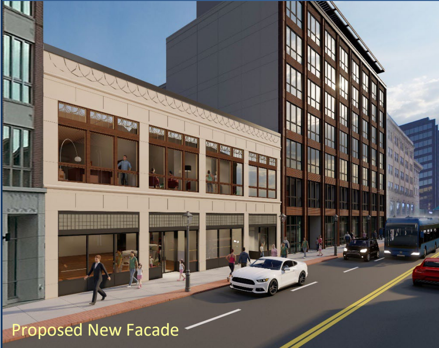
Proposed New Facade

Ranked in Top 50 Commercial Firms in U.S.