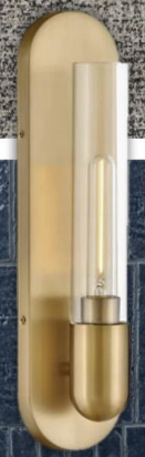
PHONE RM. SCNCE