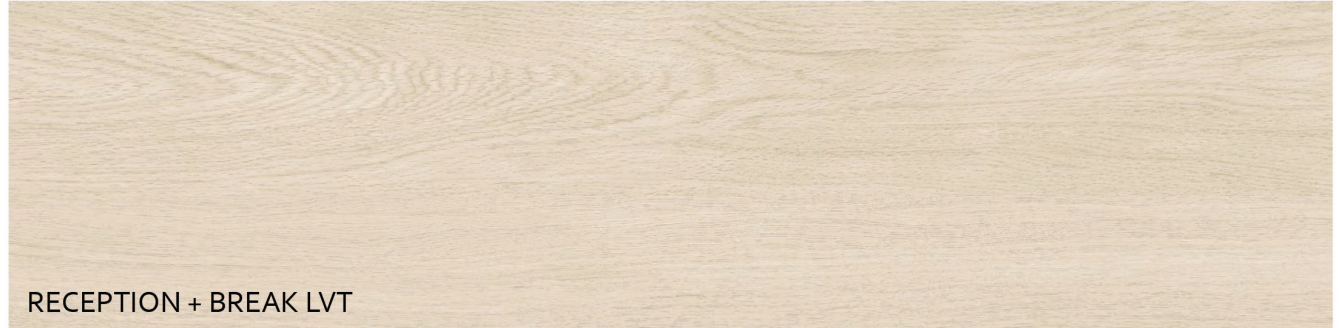
RECEPTION + BREAK LVT