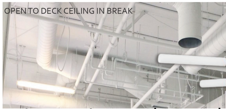
OPEN TO DECK CEILING IN BREAK