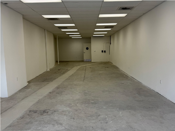
UNIT 711 ½