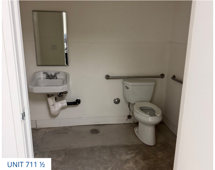
UNIT 711 ½