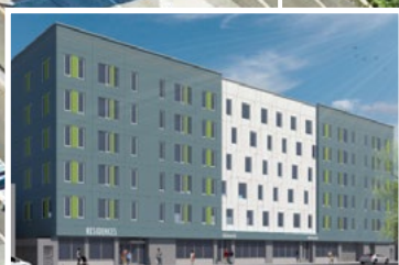
105 UNIT DEVELOPMENT DEVELOPER: OAKBROOK PARTNERS