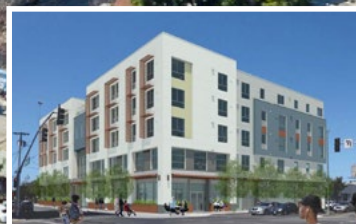
EBALDC HOUSING 95 UNIT DEVELOPMENT