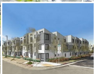
ARTHAUS BRUSH 18 UNIT DEVELOPMENT

The property is within walking distance to Uptown and Downtown. It is close to many restaurants, hotels & area amenities.