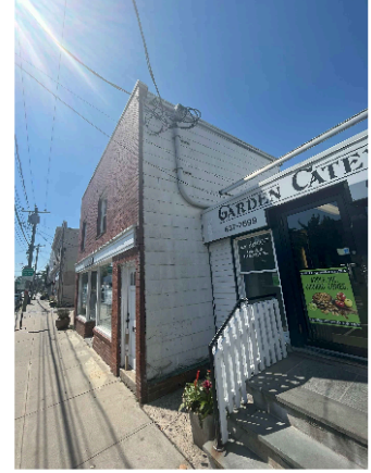
C PART. NORTH ELEVATION SCALE: 1/4" = 1'-0"