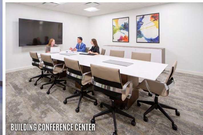
BUILDING CONFERENCE CENTER