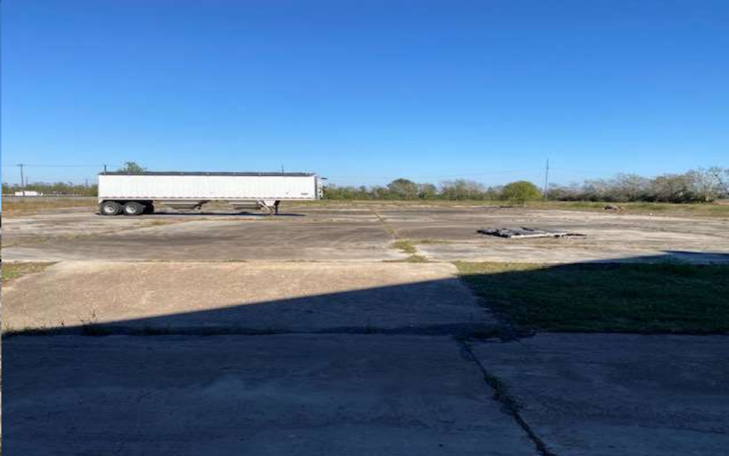
30K Cement Slab Drop Yard