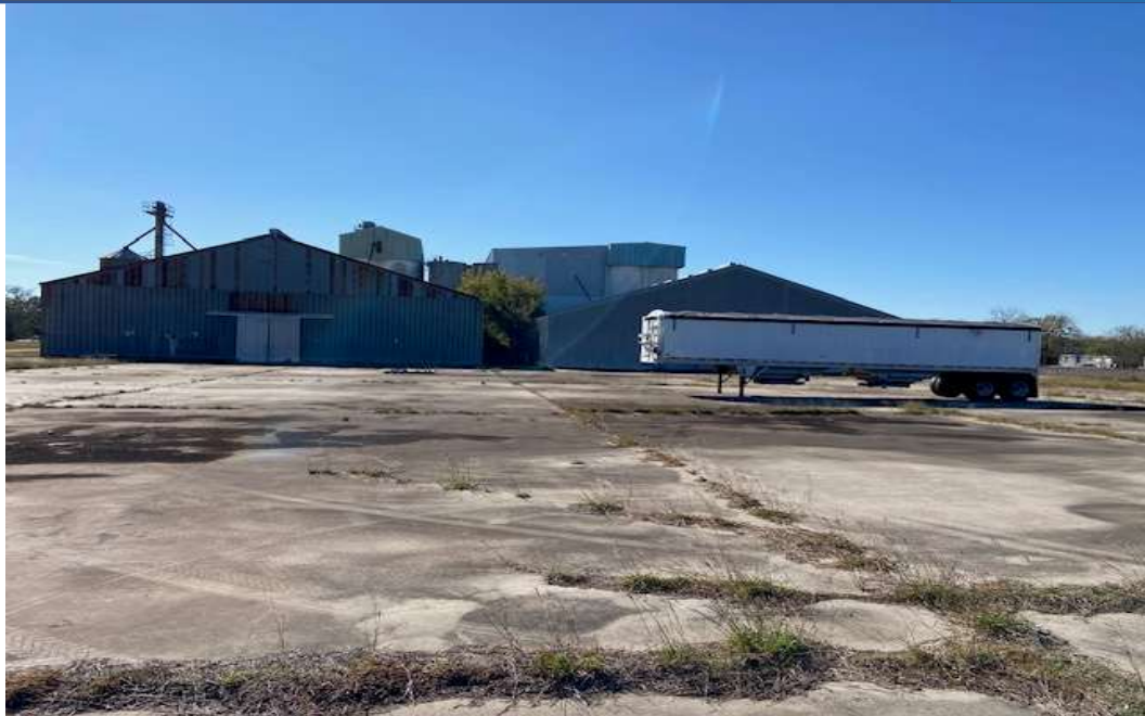
2 – 20K Sq/Ft Slab Warehouse