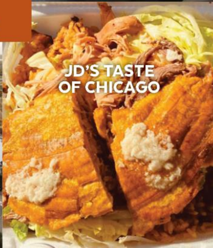
JD'S TASTE OF CHICAGO