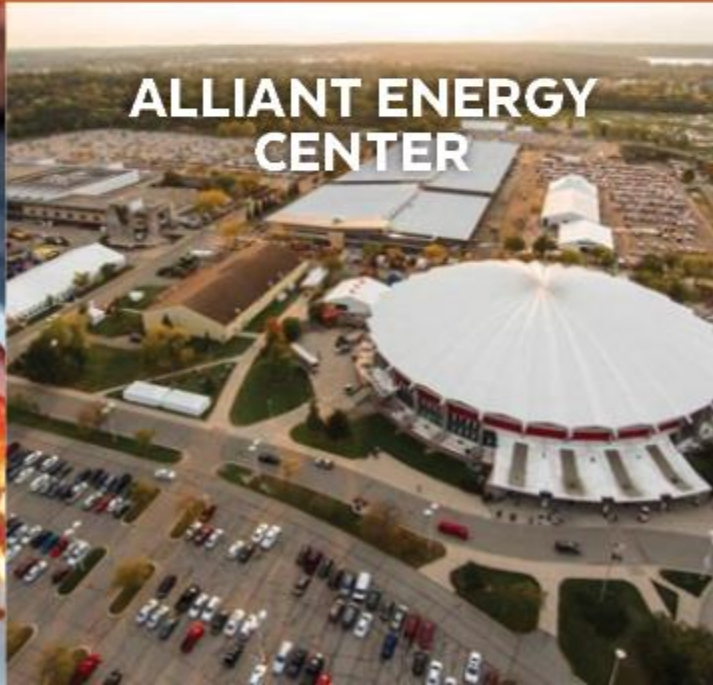
ALLIANT ENERGY CENTER