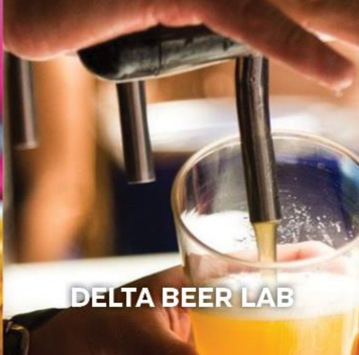
DELTA BEER LAB