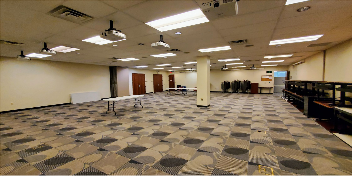
TOWN HALL TRAINING ROOM