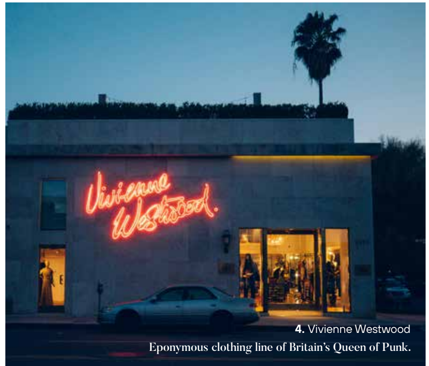
4. Vivienne Westwood Eponymous clothing line of Britain's Queen of Punk.