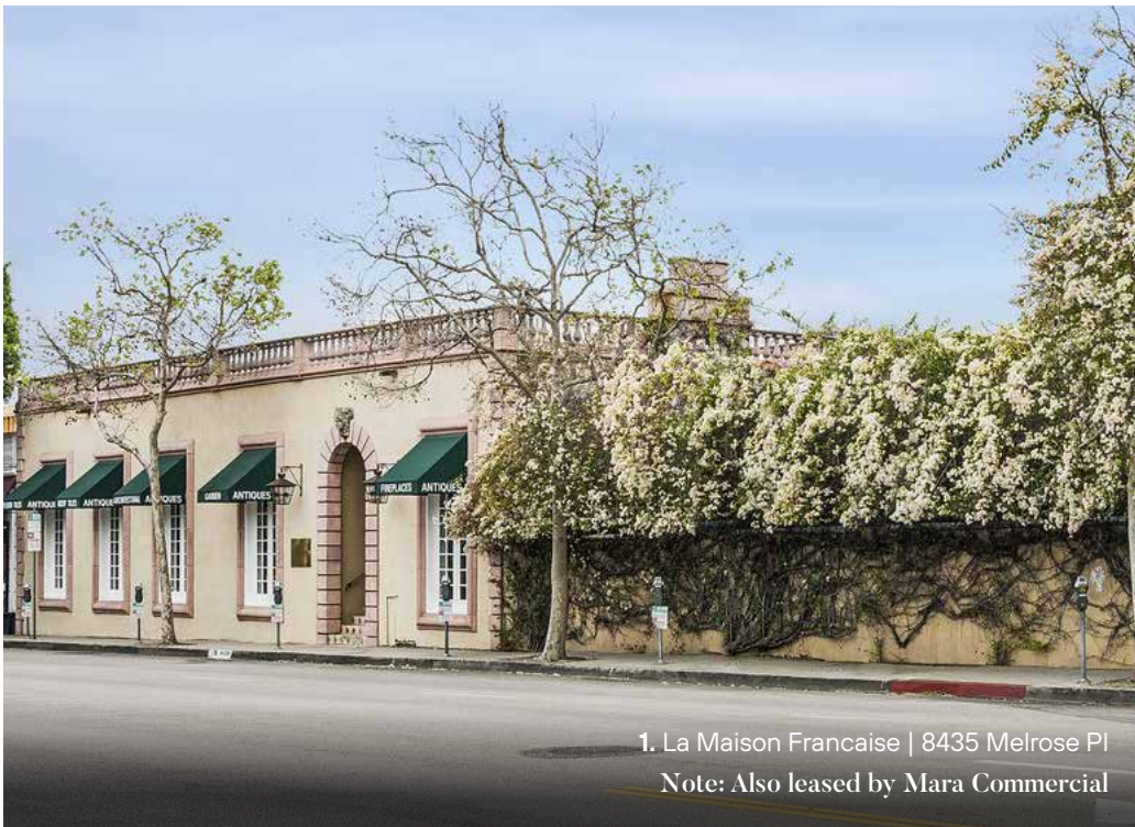
1. La Maison Francaise | 8435 Melrose Pl Note: Also leased by Mara Commercial