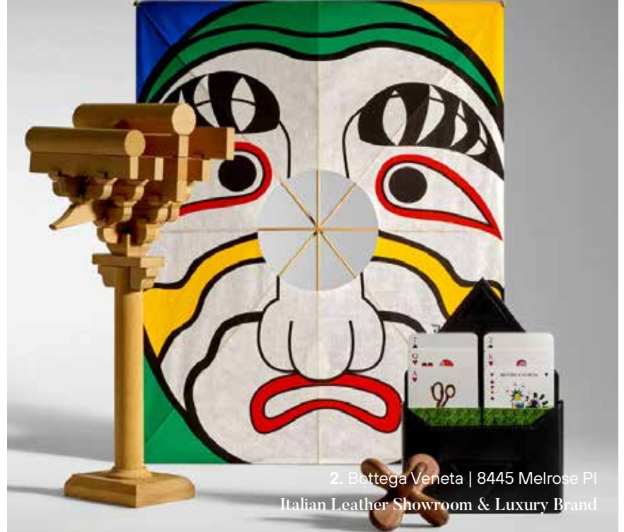
2. Bottega Veneta | 8445 Melrose Pl Italian Leather Showroom & Luxury Brand