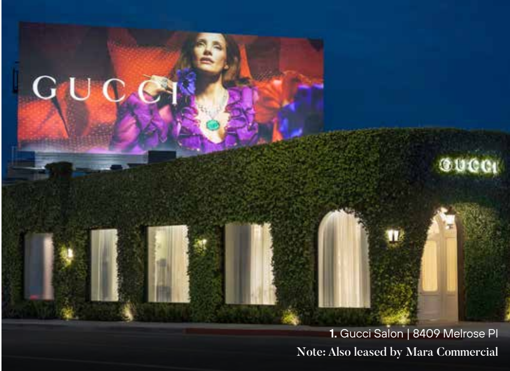
1. Gucci Salon | 8409 Melrose Pl Note: Also leased by Mara Commercial