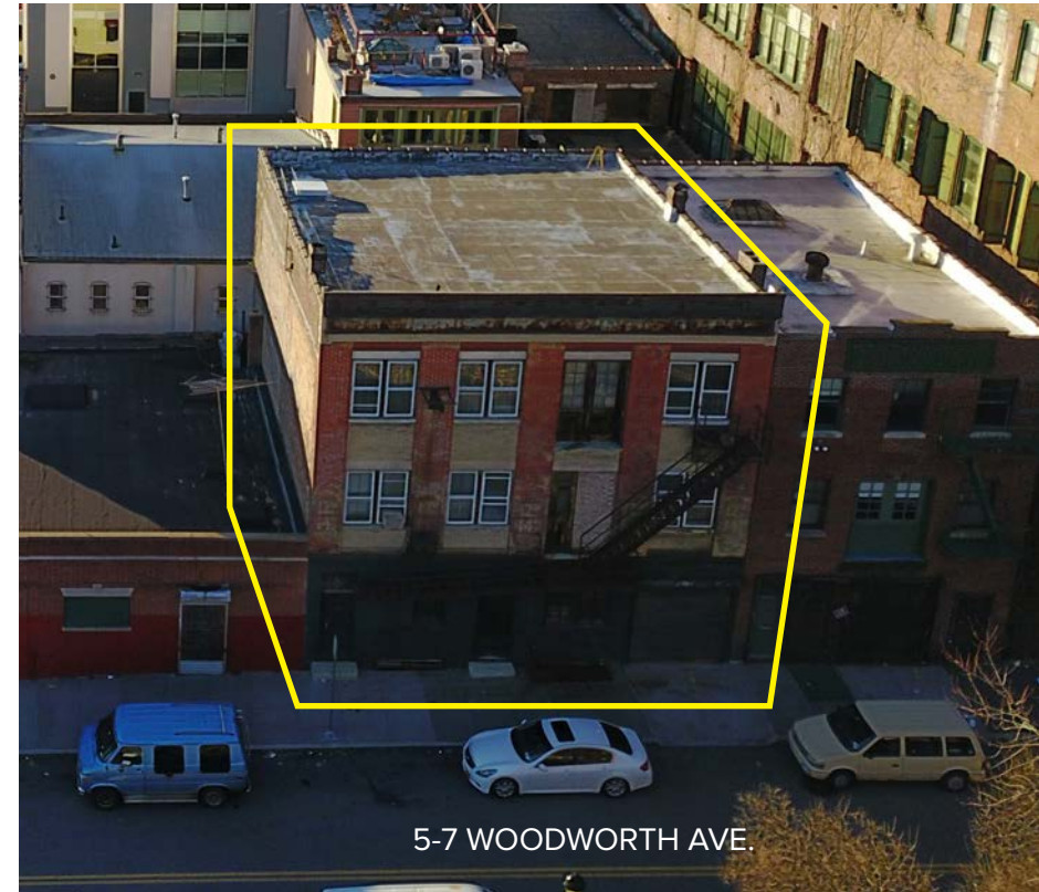
5-7 WOODWORTH AVE.