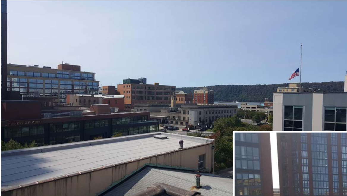
ROOF VIEW FACING RIVER