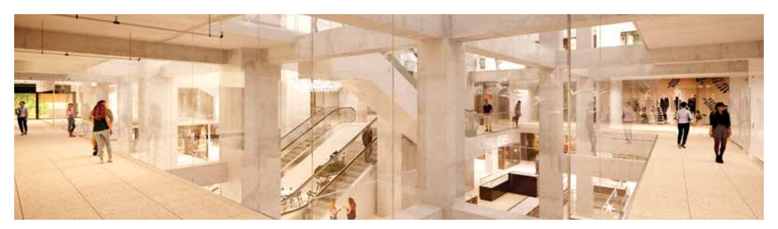
Renderings are artist's conception, approximate and subject to change without notice. Developer reserves the right to change floor plans, dimensions and specifications without notice or obligation in keeping with our policy of continual research and improvement and because alterations may become necessary due to code requirements.