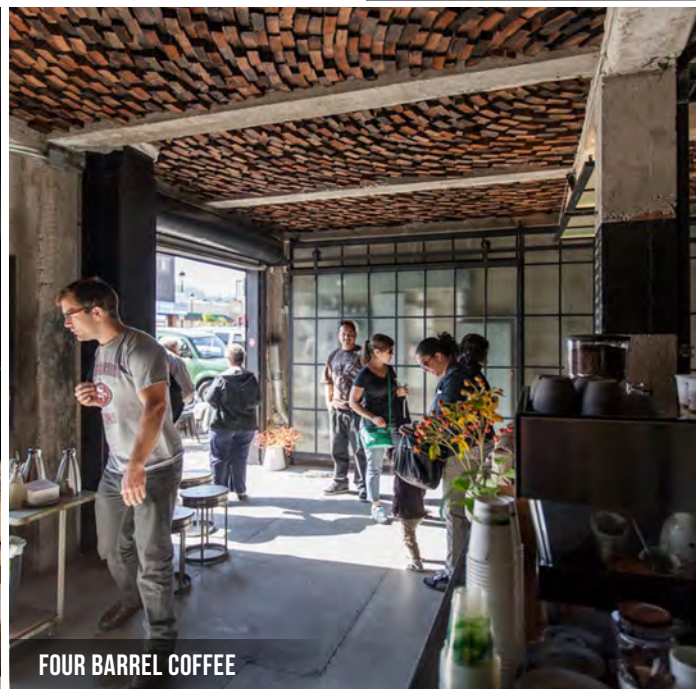
FOUR BARREL COFFEE