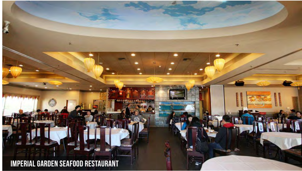
IMPERIAL GARDEN SEAFOOD RESTAURANT