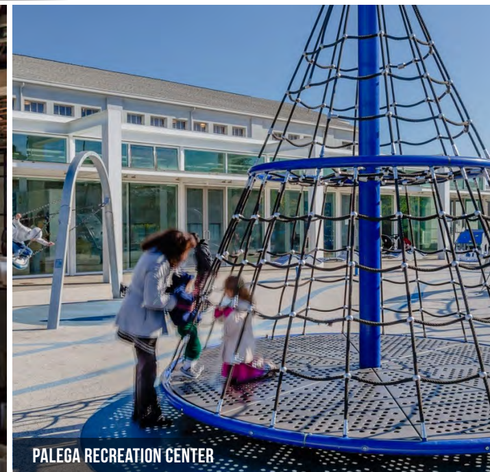
PALEGA RECREATION CENTER