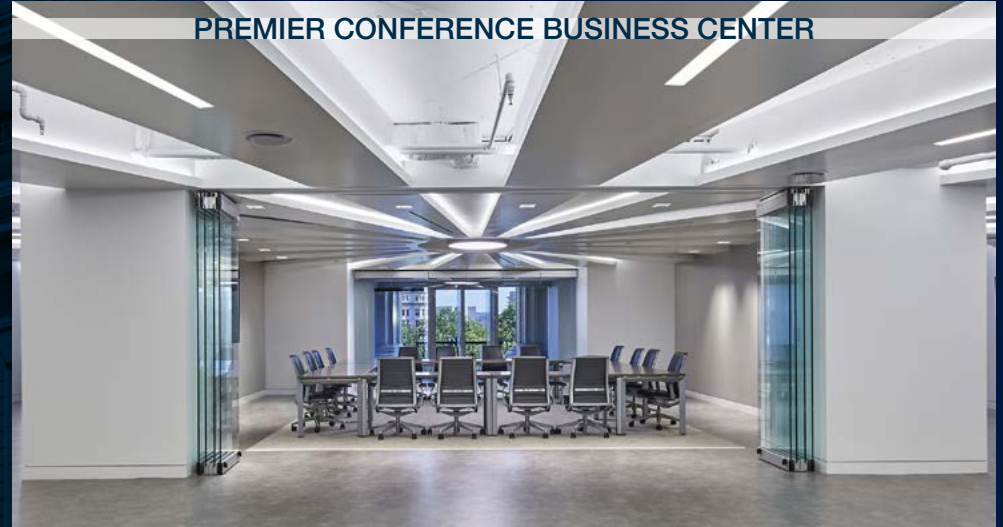
PREMIER CONFERENCE BUSINESS CENTER