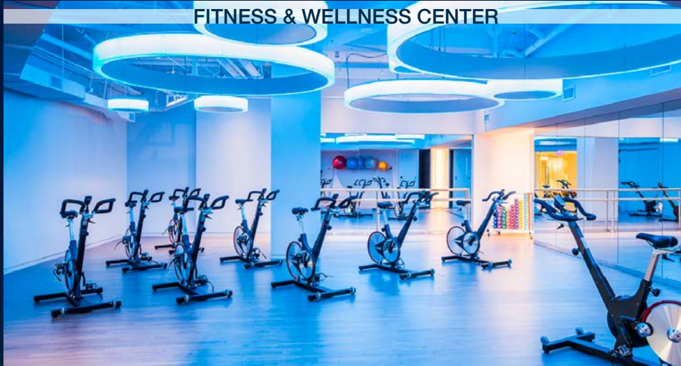
FITNESS & WELLNESS CENTER