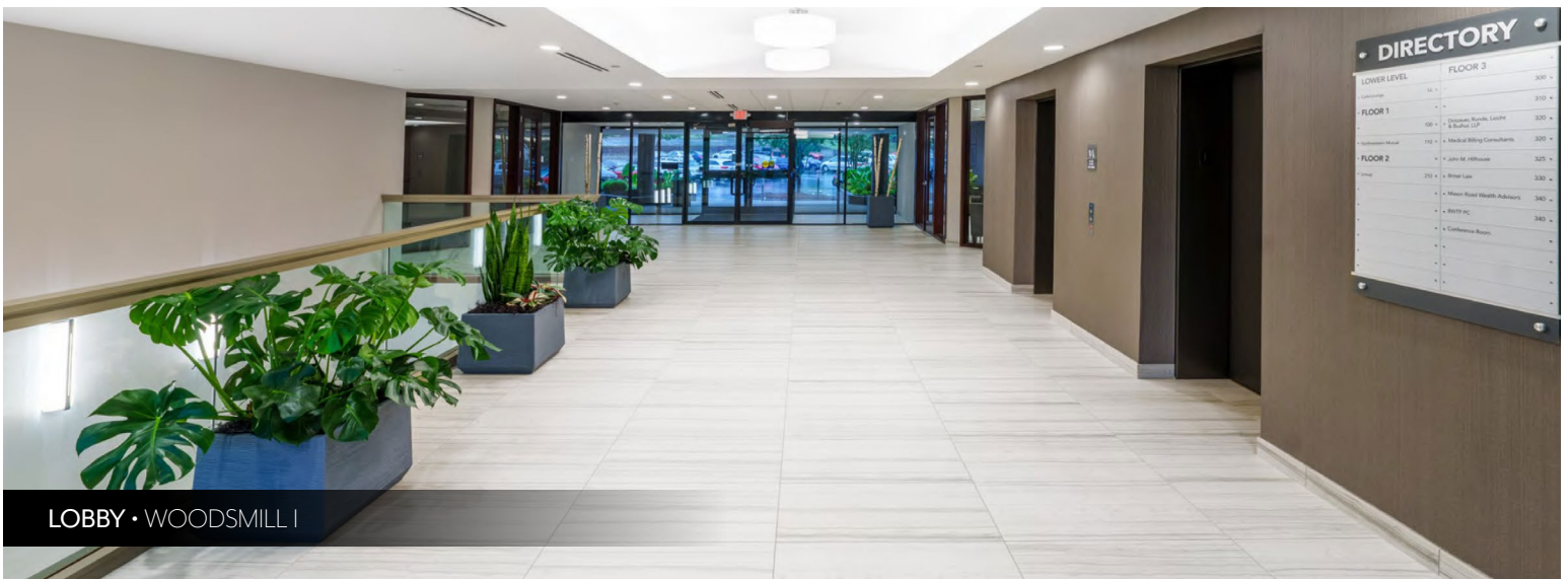
LOBBY • WOODSMILL I