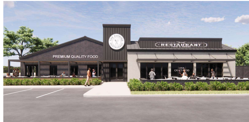
Rendering of Conceptual Facade Update 1