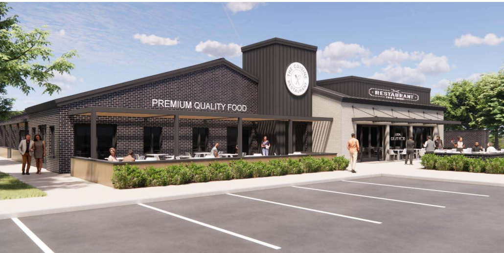
Rendering of Conceptual Facade Update 1

john greene Real Estate | 1311 S Route 59, Naperville, IL 60564 | 630.229.2290