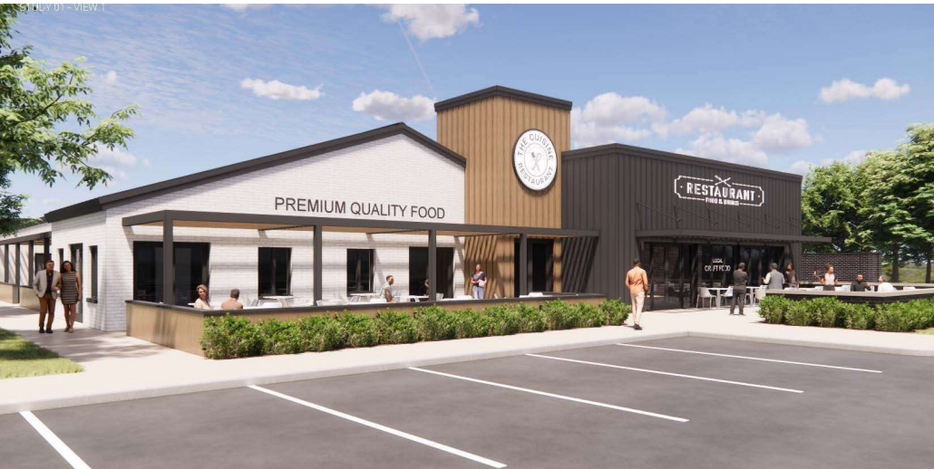
Rendering of Conceptual Facade Update 2

john greene Real Estate | 1311 S Route 59, Naperville, IL 60564 | 630.229.2290