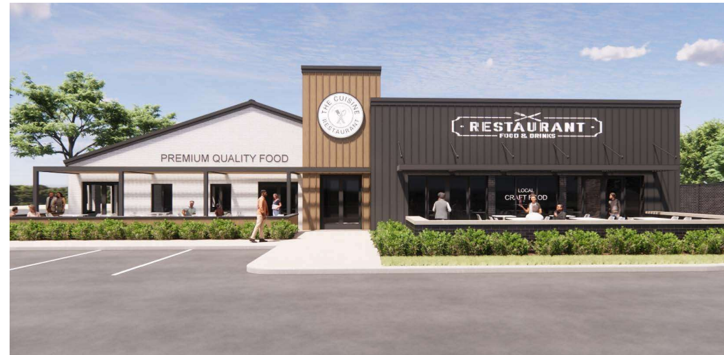
Rendering of Conceptual Facade Update 2