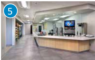
TAKE 5 CAFE