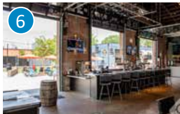
BESPOKE BREWERY PHASE 2 RETAIL