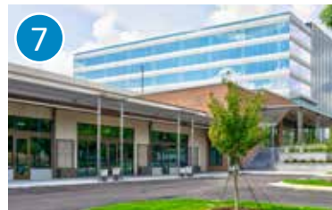
RETAIL ROW FOOD & BEVERAGE