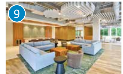
LIVING ROOM EVENT SPACE & COWORKING