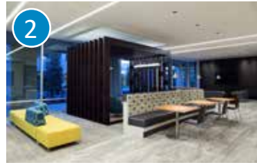
VERVE COLLABORATE LOUNGE