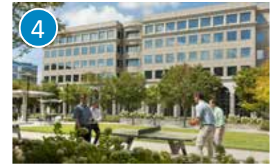
GLENLAKE LAWN OUTDOOR WORKPLACE