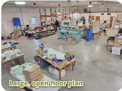
Large, open floor plan