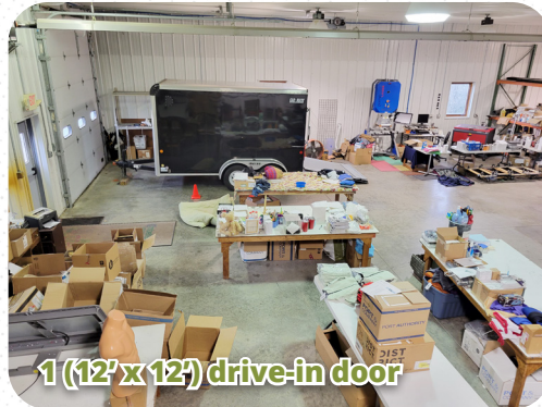
1 (12' x 12') drive-in door