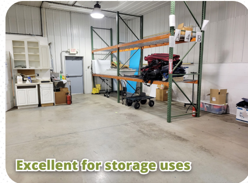
Excellent for storage uses