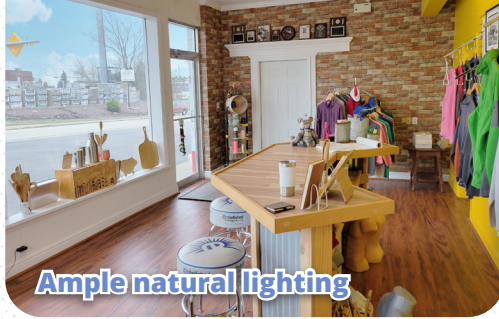
Ample natural lighting