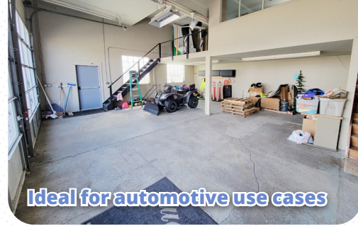
Ideal for automotive use cases