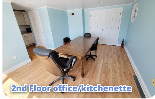
2nd Floor office/kitchenette