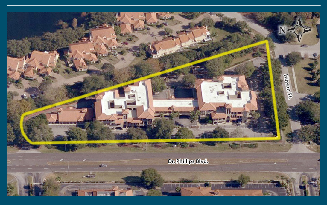
The information above has been obtained from sources believed reliable. While we do not doubt its accuracy we make no guarantee, warranty or representation about it. It is your responsibility to independently confirm its accuracy and completeness. Any projections, opinions, assumptions, or estimates used are for example only and do not represent the current or future performance of the property. Hold-Thyssen, Inc. is a licensed real estate broker.