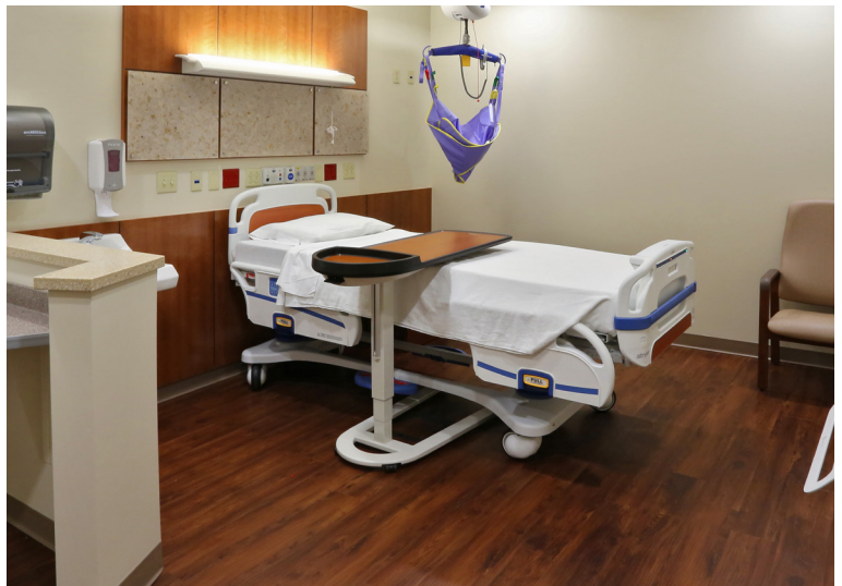
All photos are representative of Uniland medical developments.