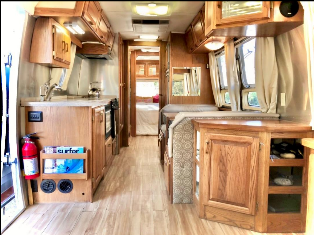
NORTH VIEW - living room