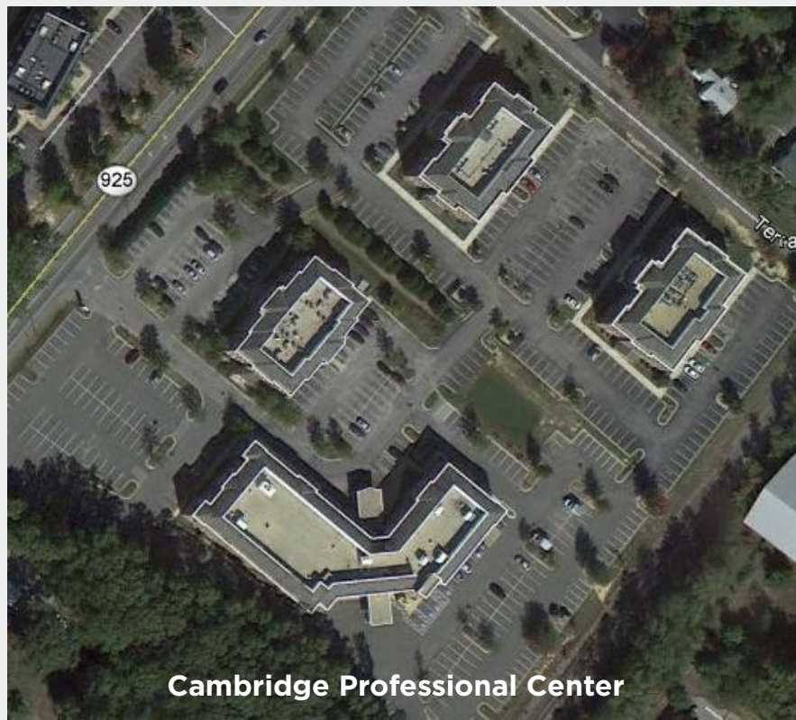
Cambridge Professional Center