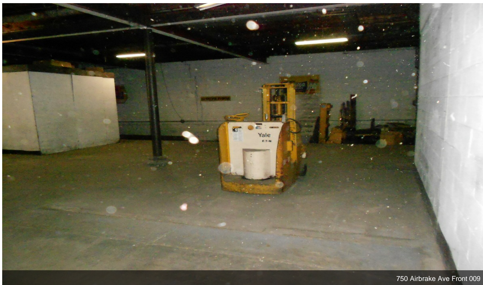
750 Airbrake Ave Front 009