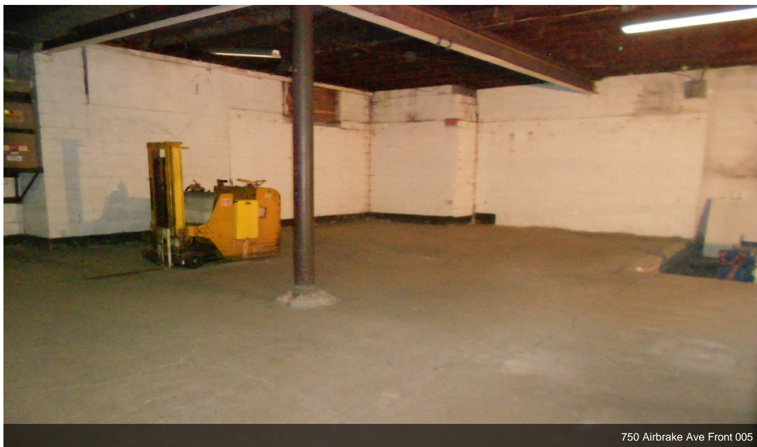
750 Airbrake Ave Front 005