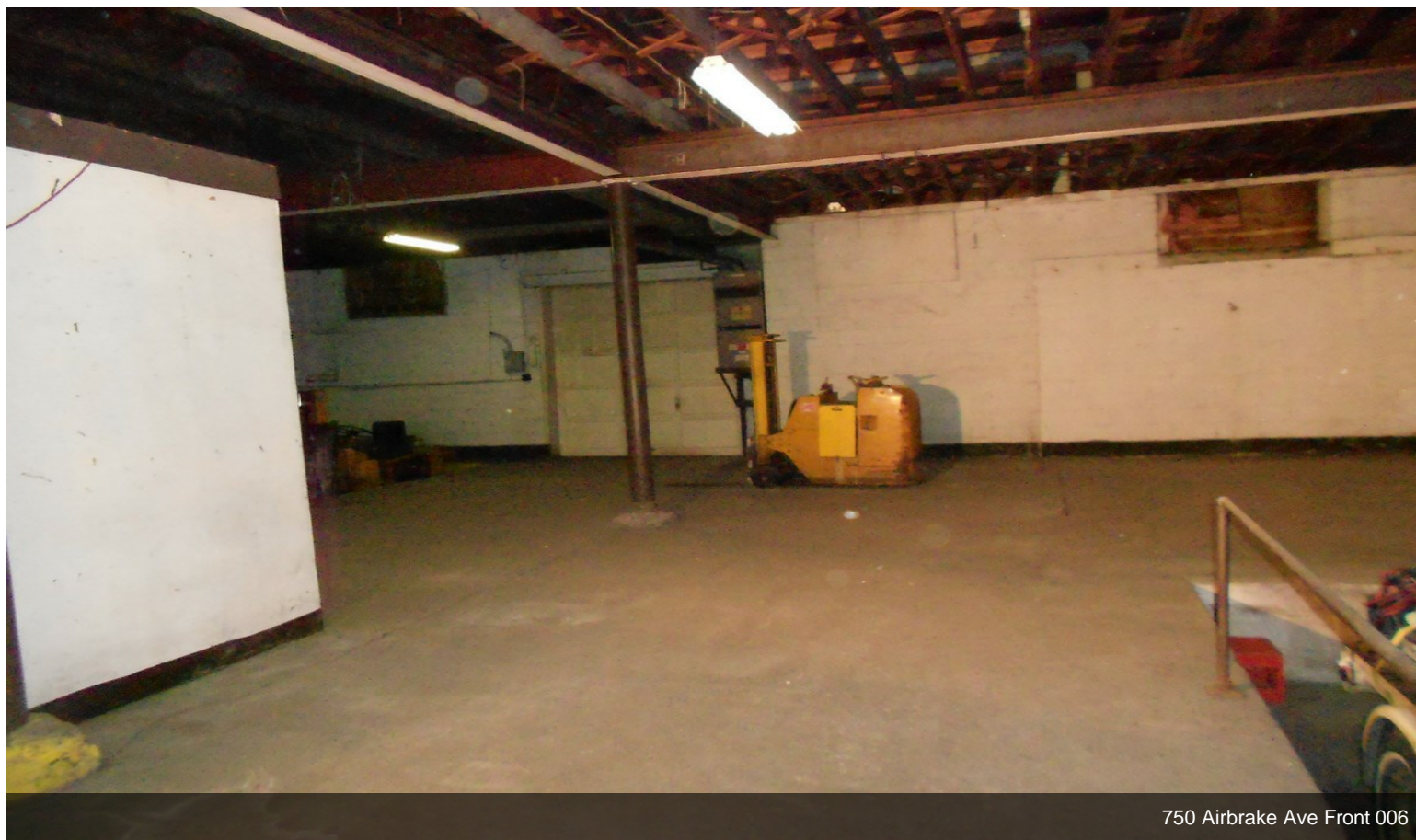
750 Airbrake Ave Front 006