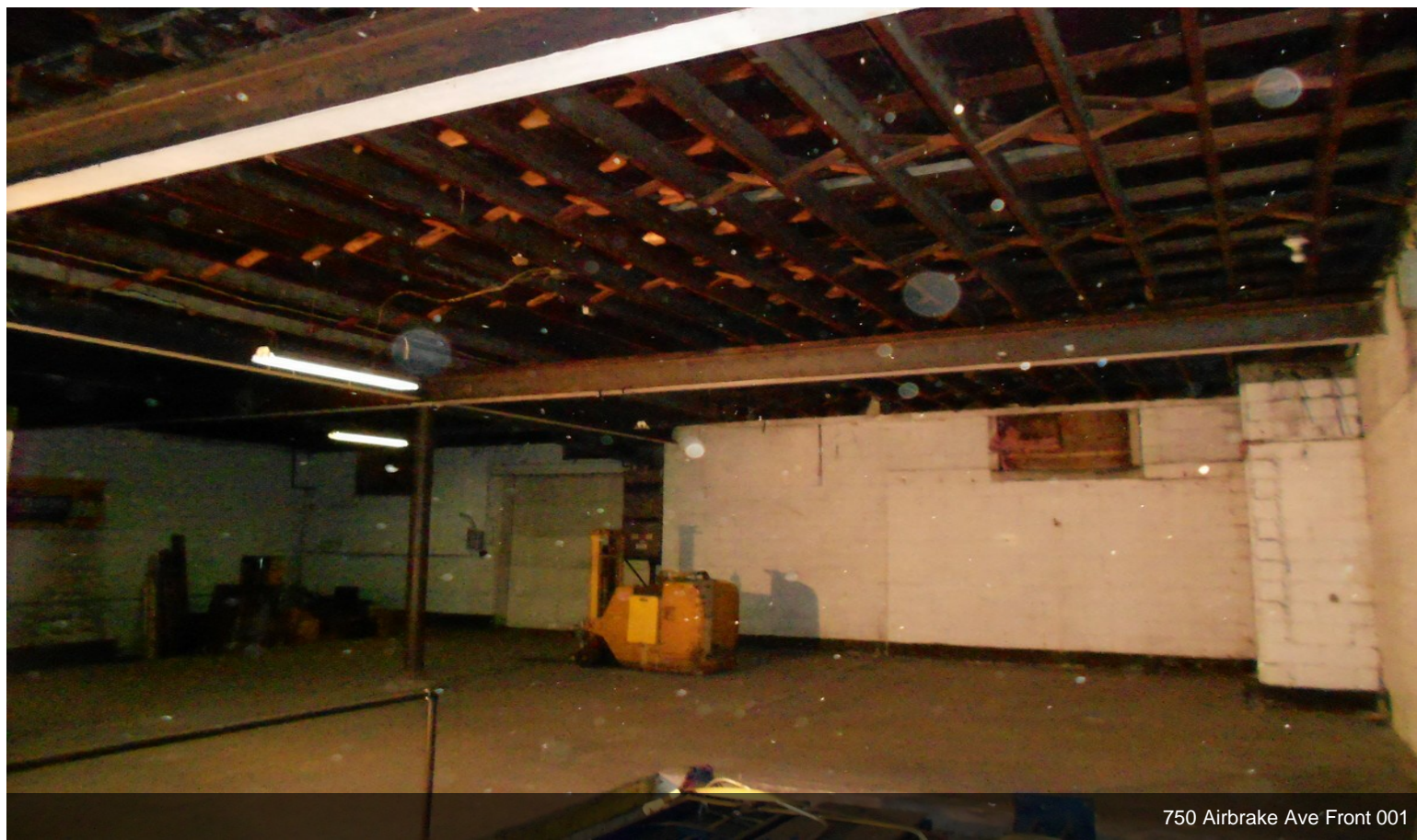
750 Airbrake Ave Front 001