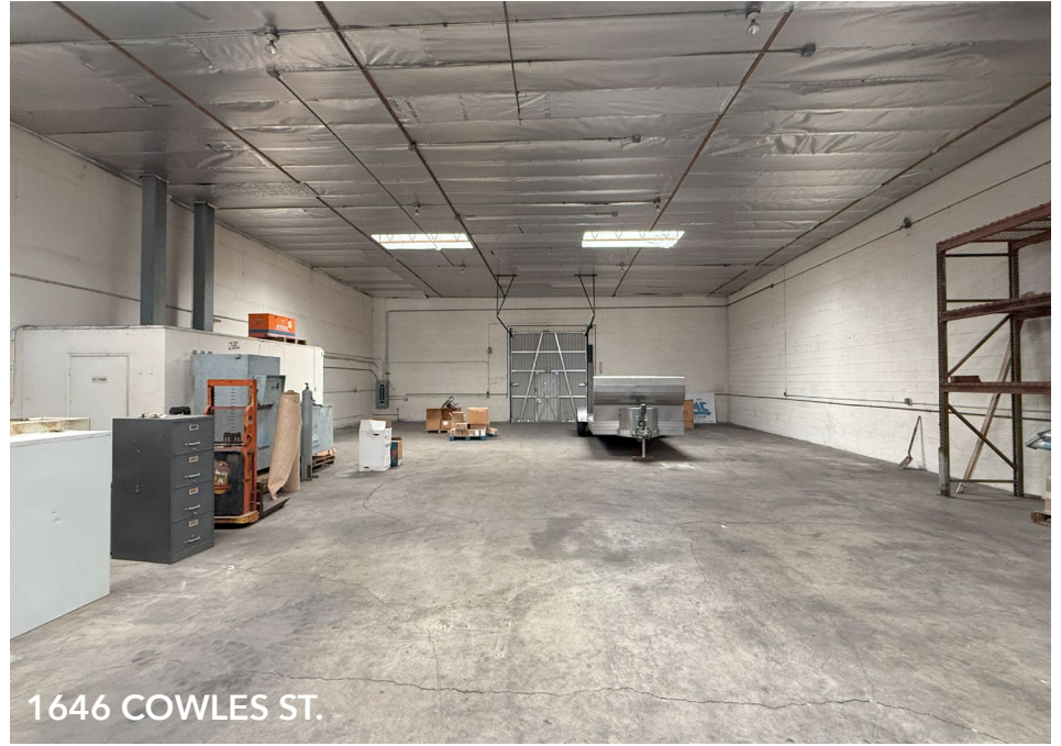
1646 COWLES ST.