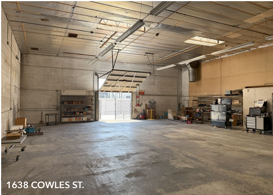
1638 COWLES ST.