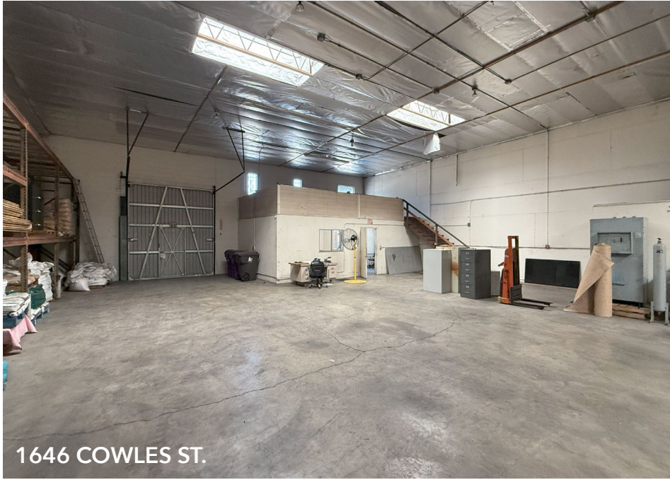
1646 COWLES ST.