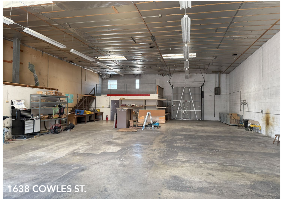
1638 COWLES ST.