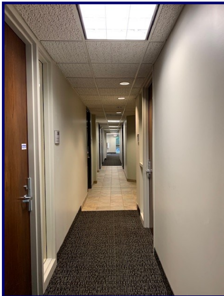
First Floor Hallway