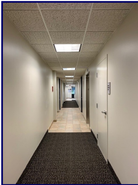
First Floor Hallway