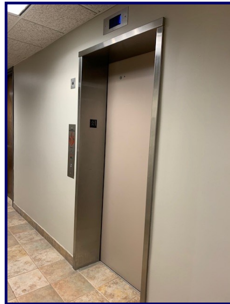
Two Level Elevator