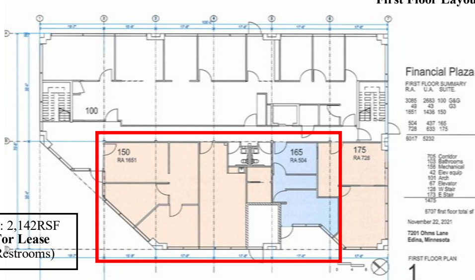
First Floor Layout

Suite 150/165: 2,142RSF Available For Lease (Excluding Restrooms)