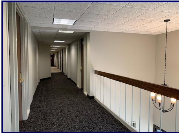
Second Floor Hallway