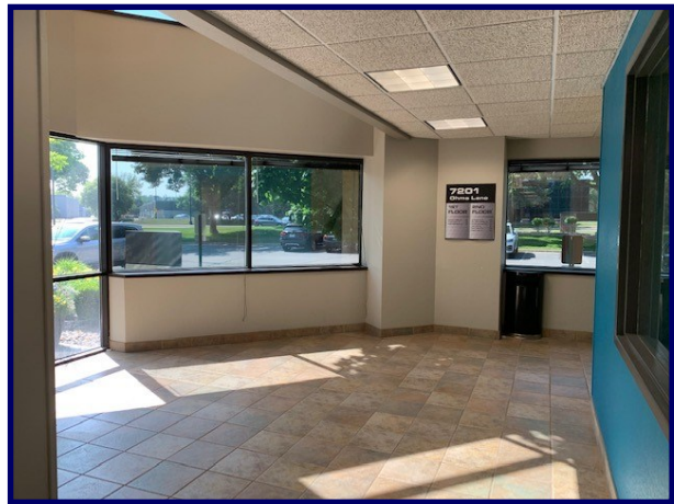
First Floor Lobby Atrium