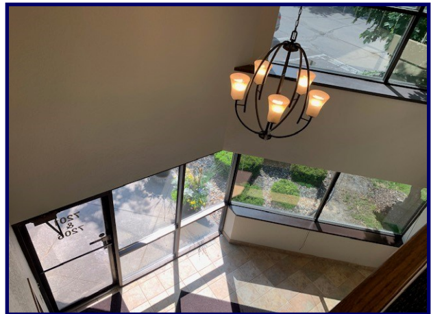
Atrium from Second Floor