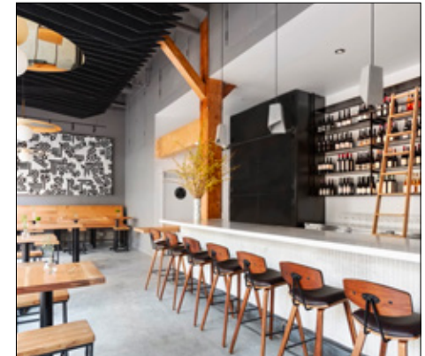
EBB & FLOW