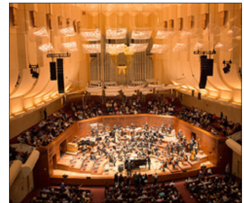
DAVIES SYMPHONY HALL