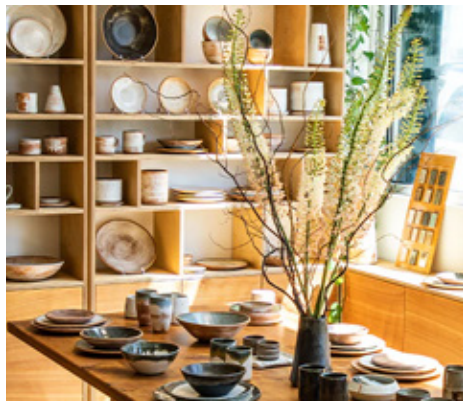
MM CLAY CERAMICS