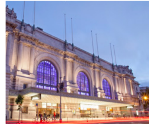
BILL GRAHAM CIVIC AUDITORIUM