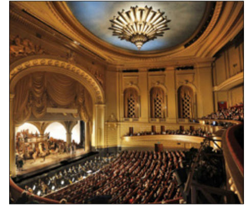
WAR MEMORIAL OPERA HOUSE