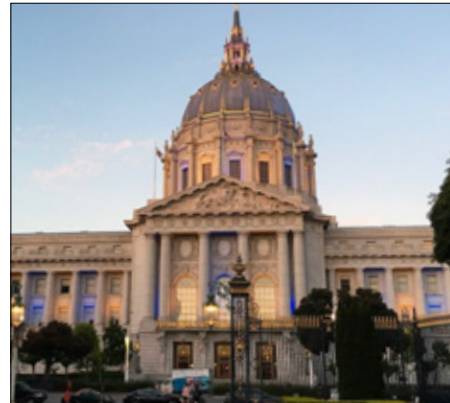
WAR MEMORIAL & PERFORMING ARTS CENTER