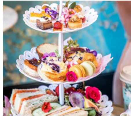
SON & GARDEN