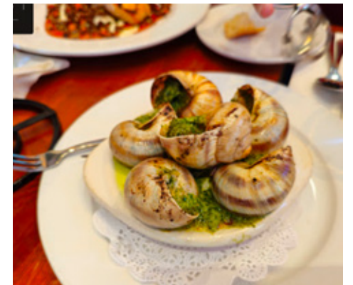
CHEZ MAMAN WEST