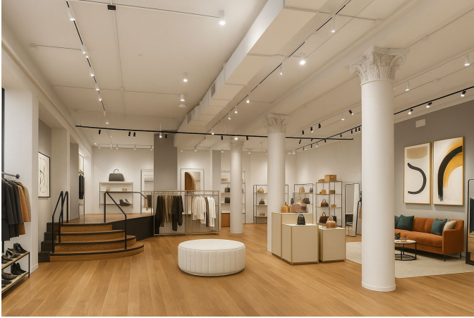
Ground Floor 4,000 SF