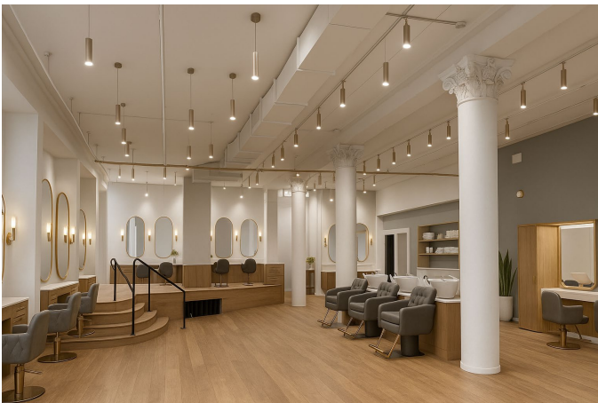
Lower Level 2,800 SF