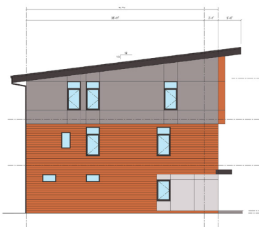
1 LEFT SIDE ELEVATION

Twisp is growing both as a popular spot for vacationers as well as virtual commuters looking to escape city living. On the Eastern side of the Cascade Mountains, Twisp has easy access to the Okanagan-Wenatchee National Forest, the wine regions of Chelan and Okanagan, and seasonal hiking and skiing.