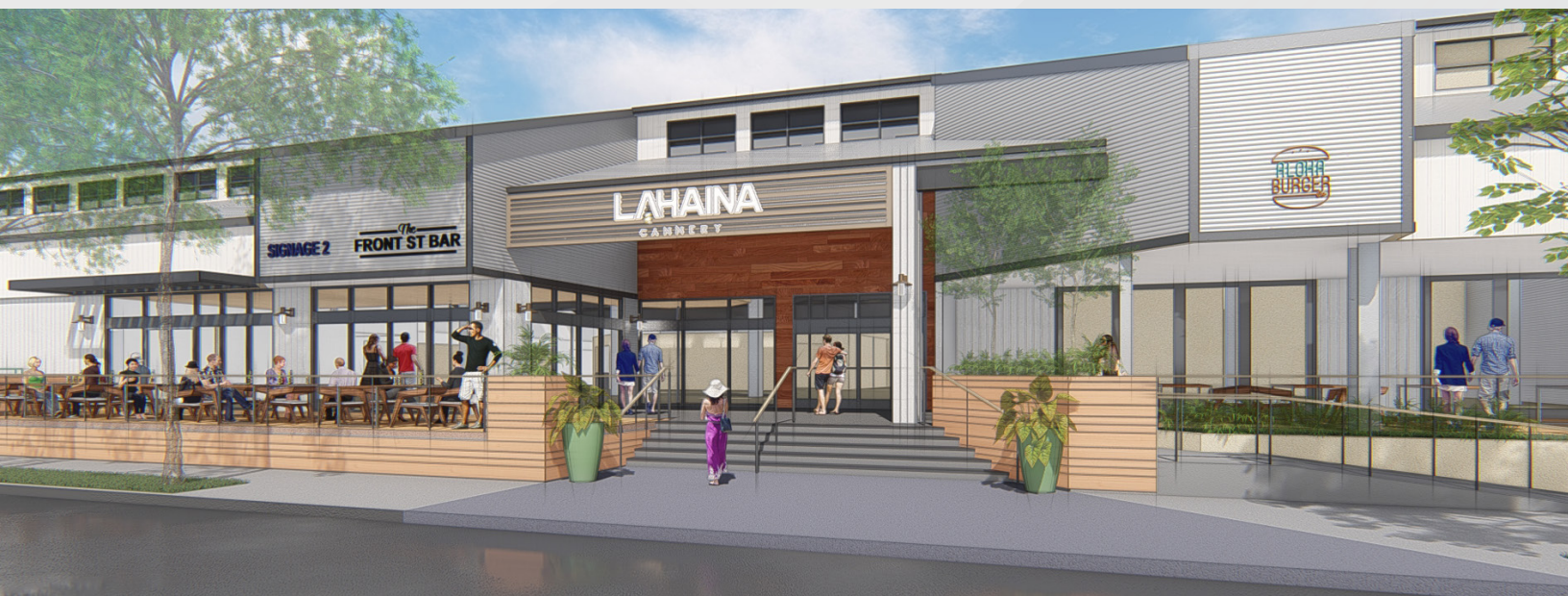
NEW FRONT STREET MALL ENTRY