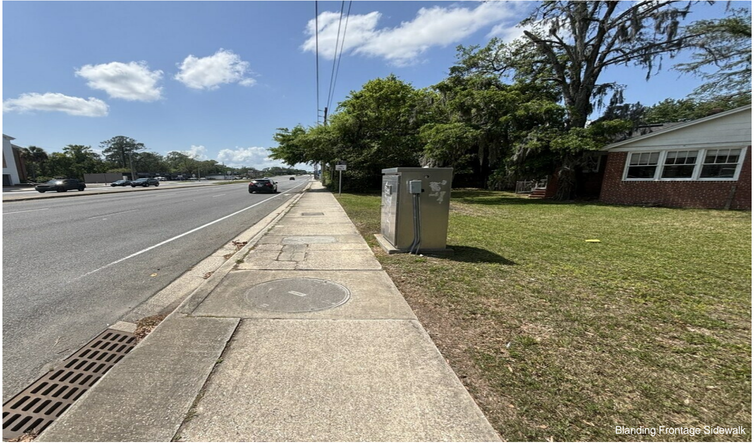
Blanding Frontage Sidewalk