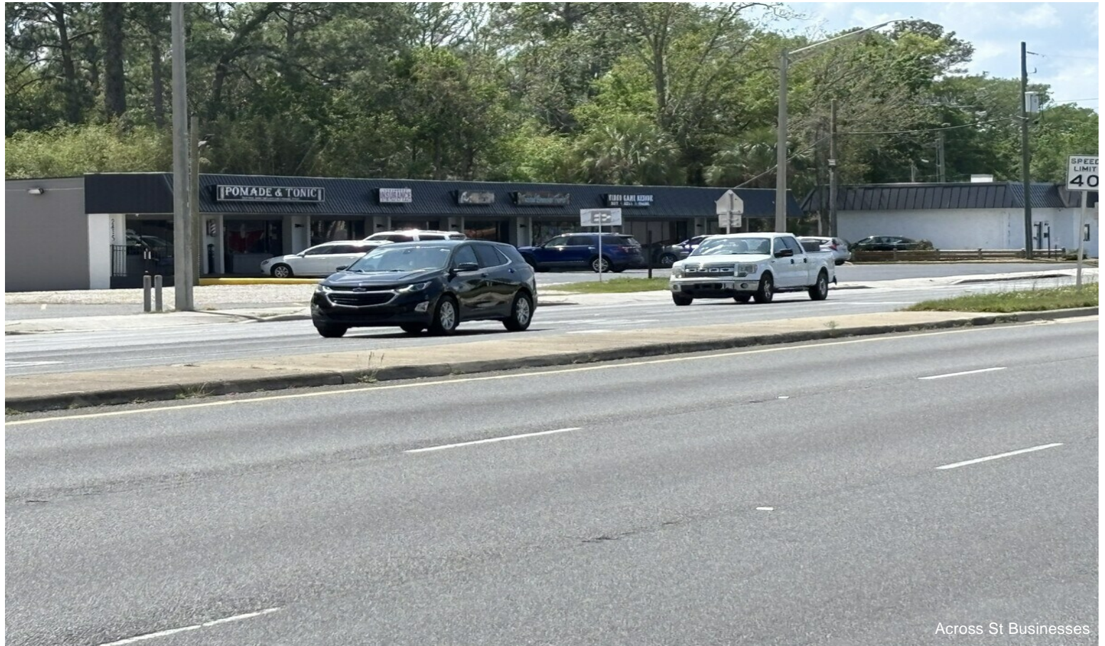
Across St Businesses