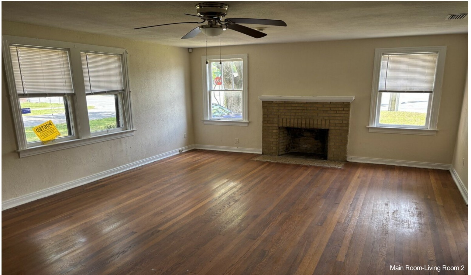
Main Room-Living Room 2