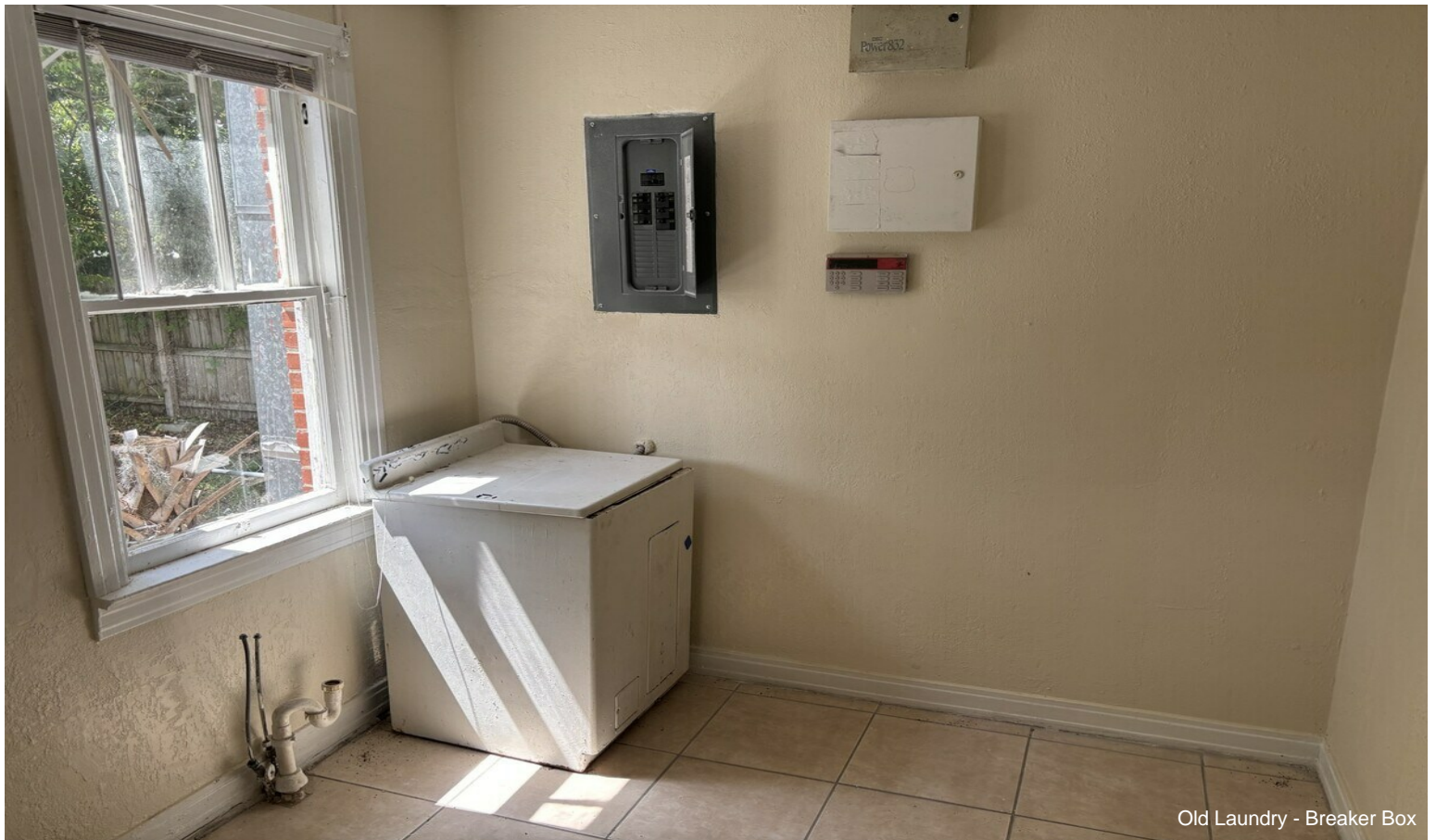
Old Laundry - Breaker Box