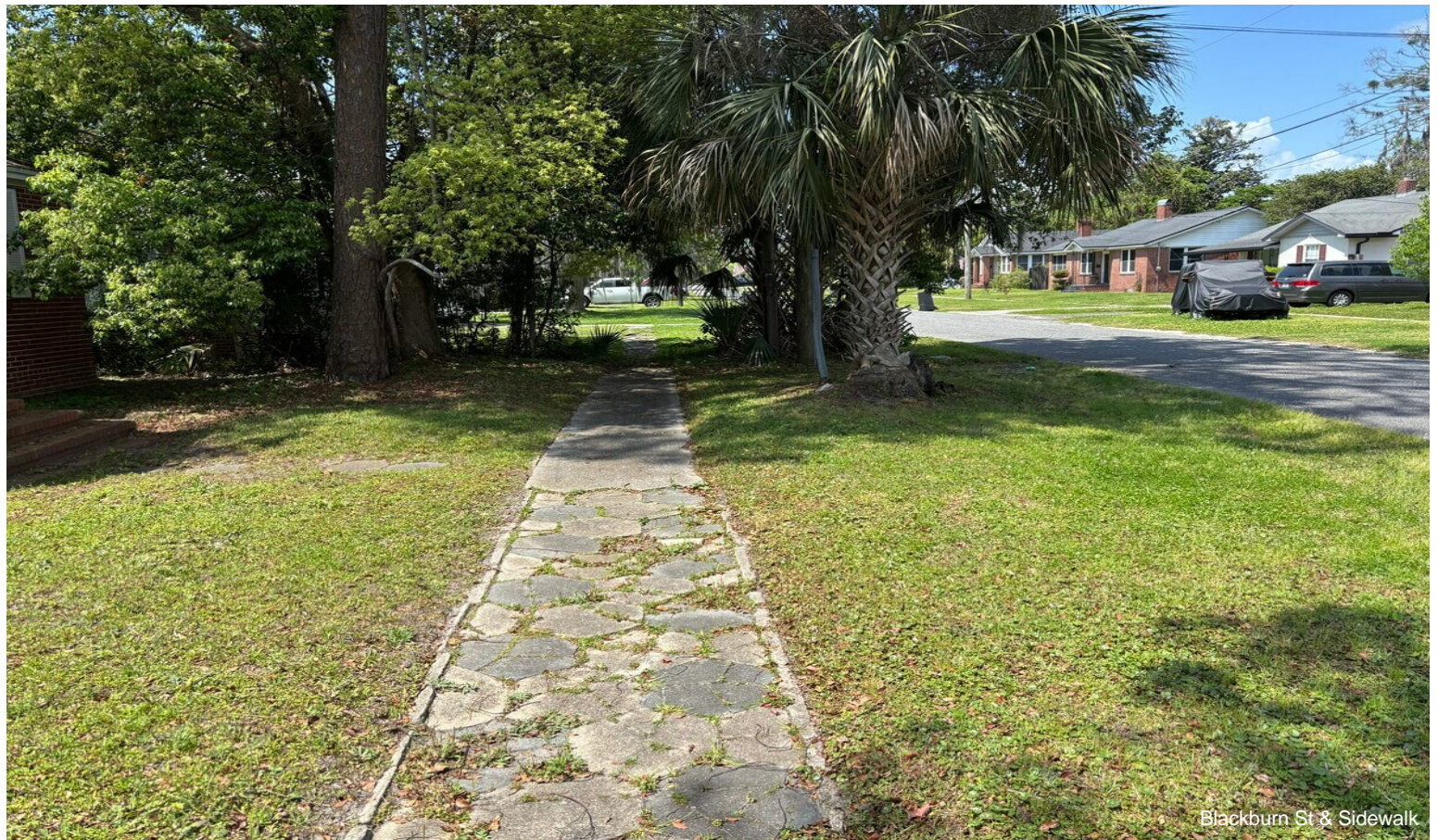
Blackburn St & Sidewalk