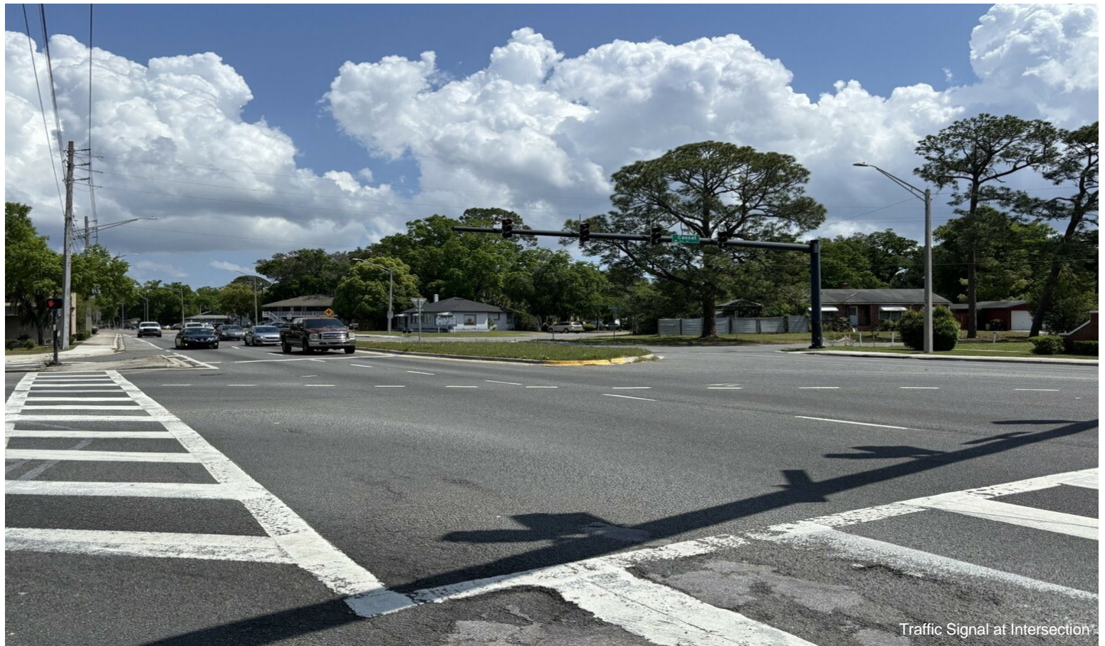
Traffic Signal at Intersection