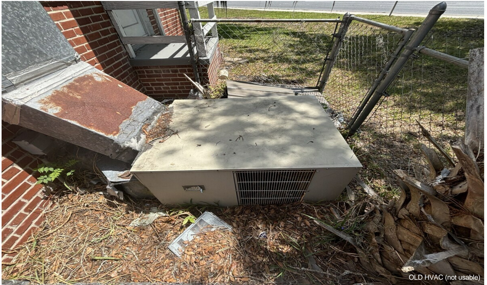
OLD HVAC (not usable)