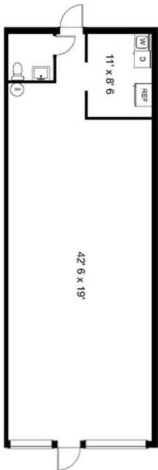
STE 6 (1,221± RSF) Former Hair Salon Available May 1, 2026