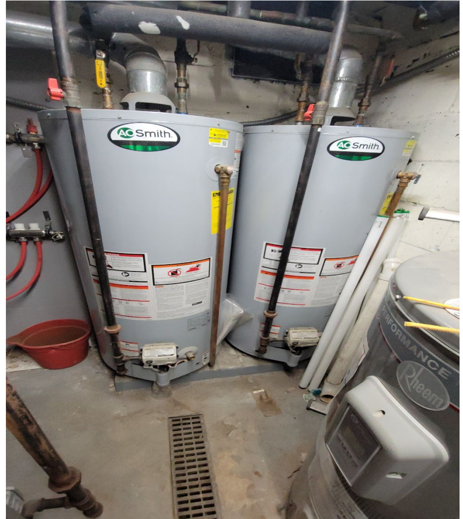
Highly Efficient Utility Systems & Solar Panels on Roof