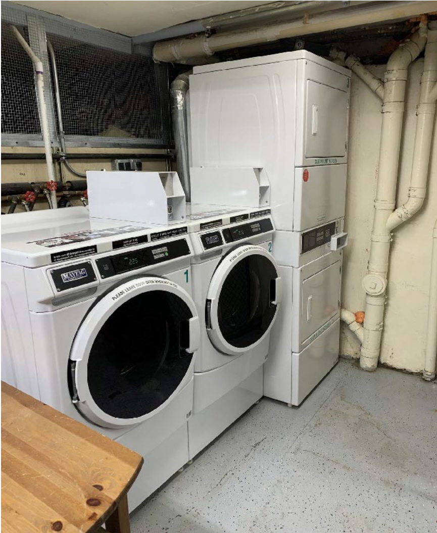
Tenant Laundry Room