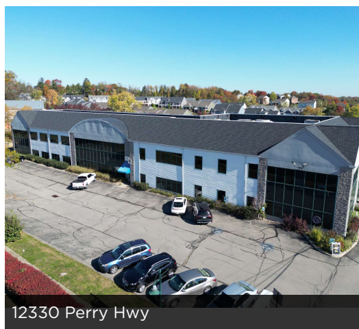
12330 Perry Hwy