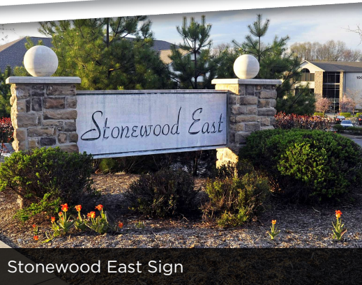
Stonewood East Sign