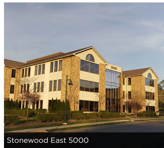
Stonewood East 5000