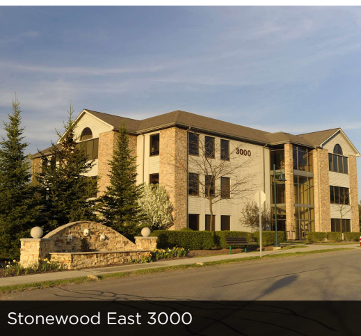
Stonewood East 3000