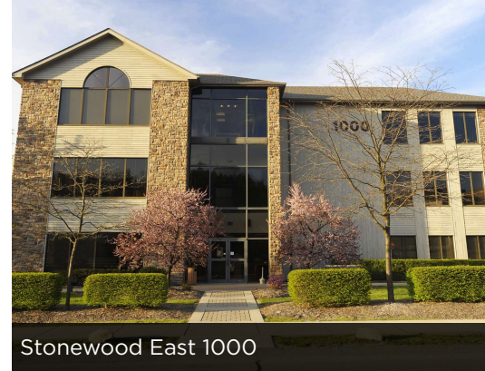
Stonewood East 1000