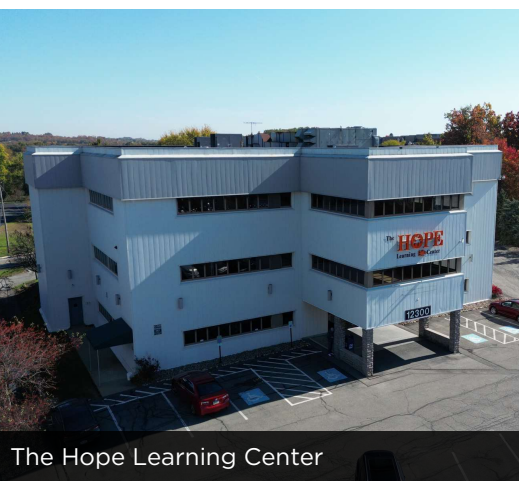
The Hope Learning Center