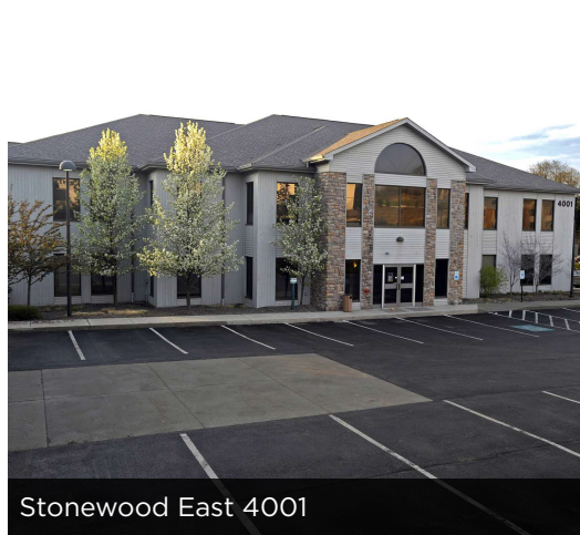
Stonewood East 4001