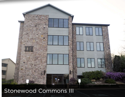
Stonewood Commons III