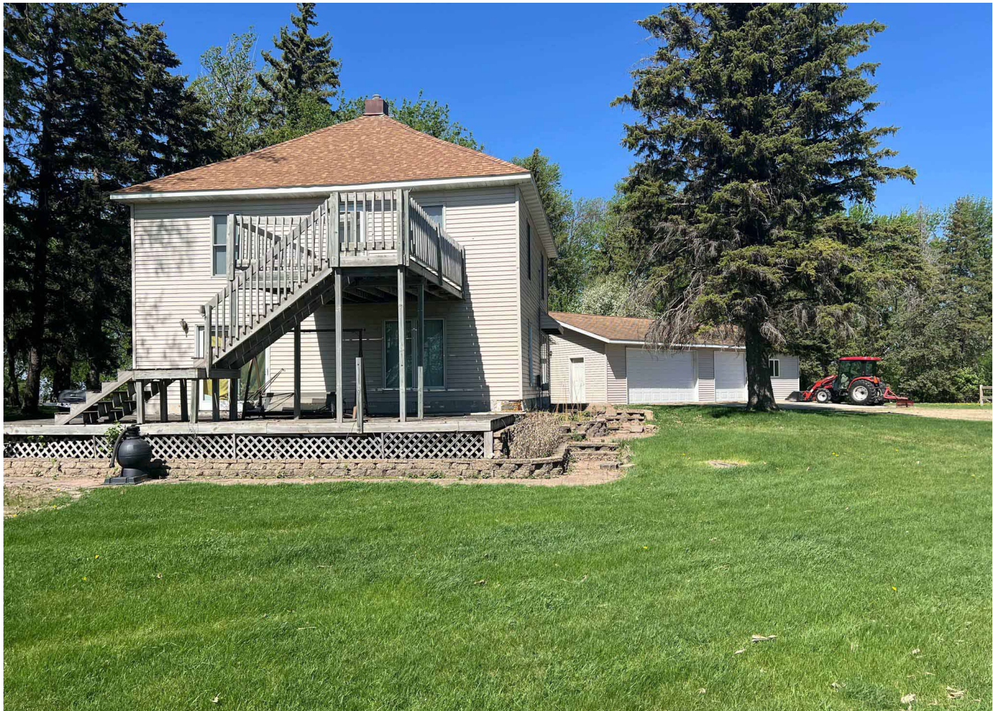
Home square footage: 930 SF 2 level and 1,344 SF detached garage