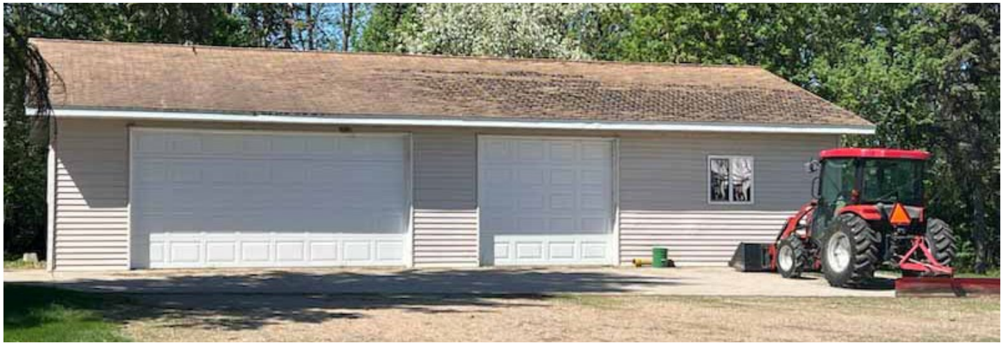
Year Built: Home 1905 and Garage in 2006